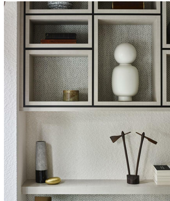
03 Reference - Shadow Gap Detail scale 1:N/A @A3