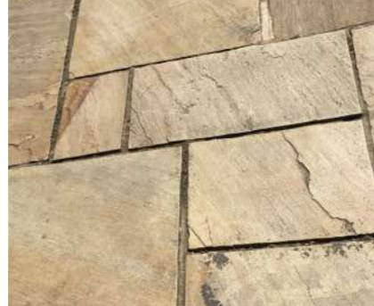
Front Garden Palette