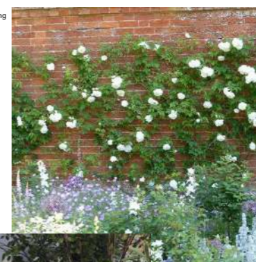
Bedding & Climbing Planting Examples: