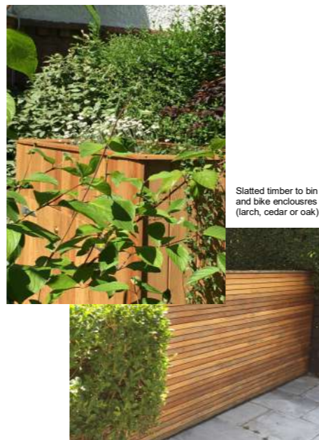
Slatted timber to bin and bike enclosures (larch, cedar or oak)