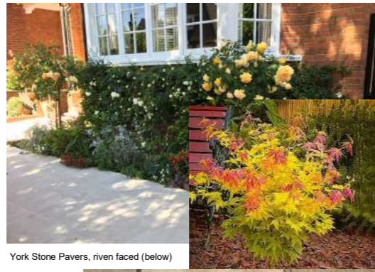
York Stone Pavers, riven faced (below)

Planting Examples: Red and Variegated Photinia (Red Robin) Laurel Royal Purple Silver Queen Hydrangea Acer Peony