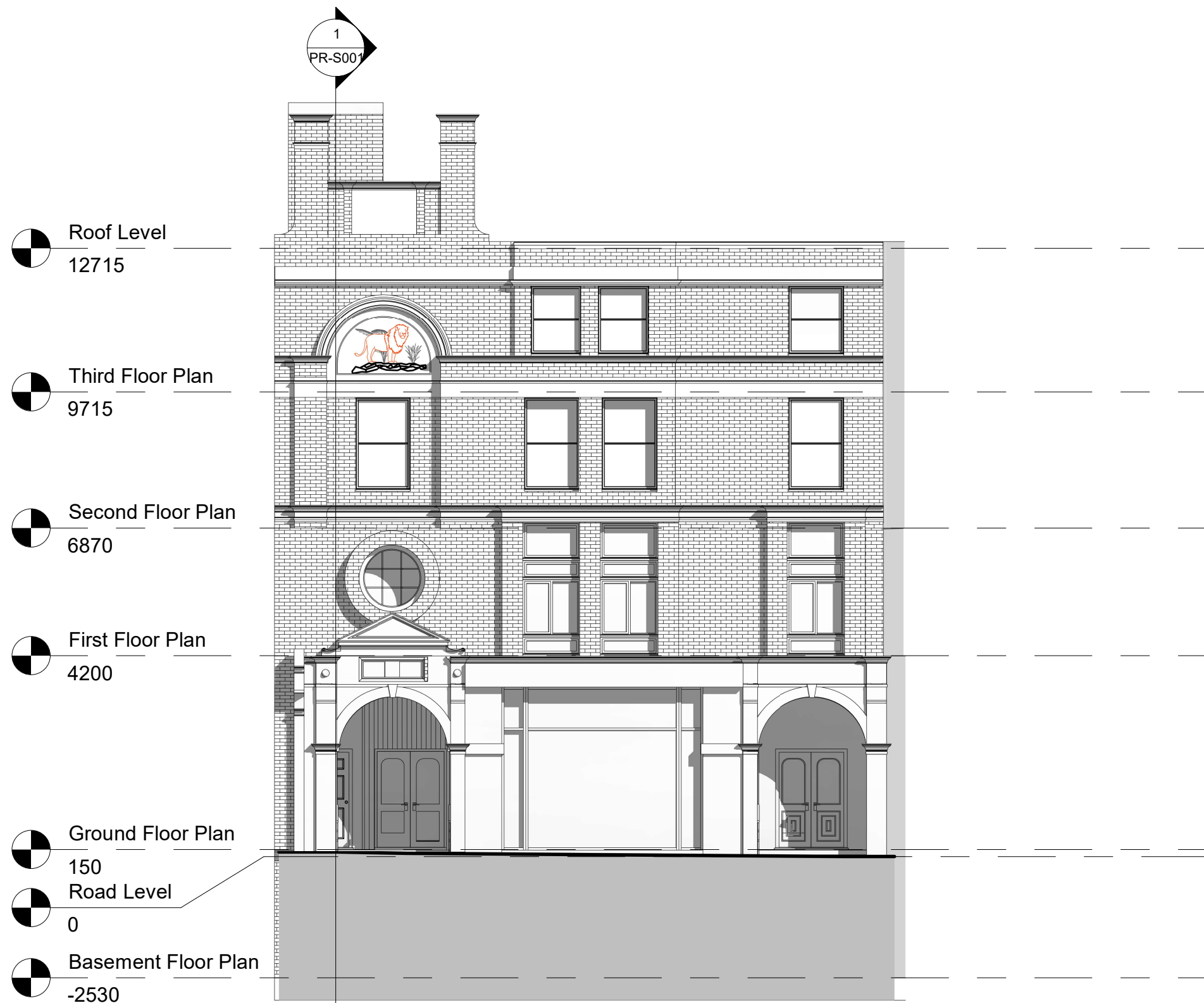
1 Front Elevation 1 : 100