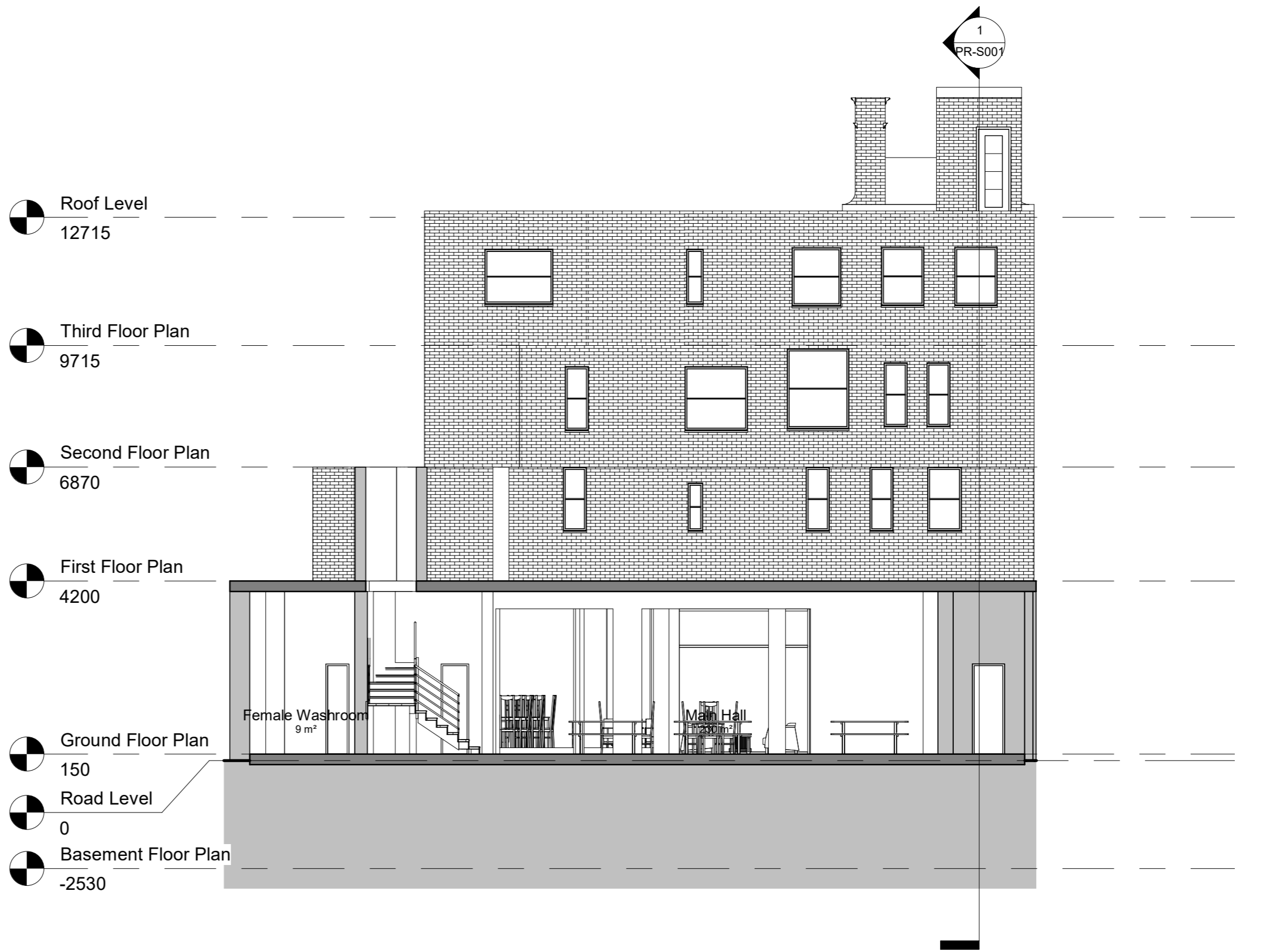
1 Section C'C 1 : 100