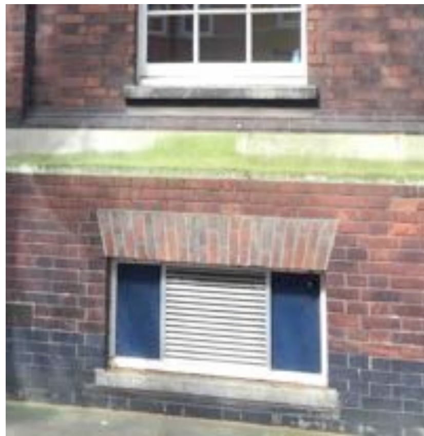
Louver - As Existing

Louver is installed into retained openings. Louver is made from Aluminium.