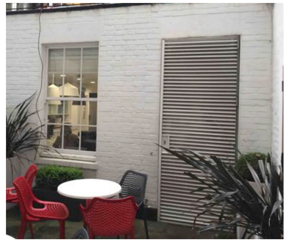
Louver - As Existing

Drawing notes Doors will be Gilbert Louver doors ref: WDS-75 Polyester power coated - Colour: White. Satin finish. Door is installed into retained opening. Doors are made from Aluminium.