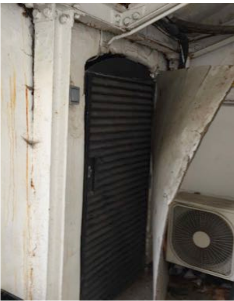
Door 3 - As Existing