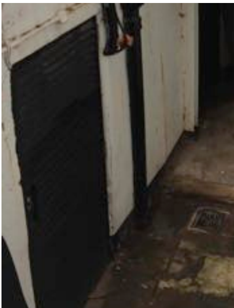
Door 2 - As Existing