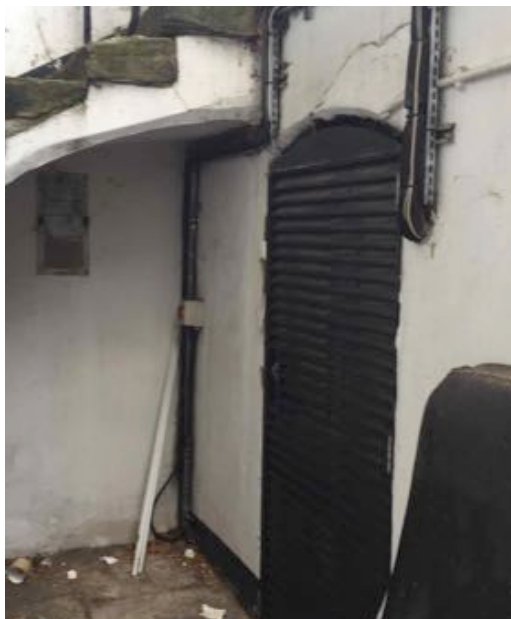
Door 1 - As Existing