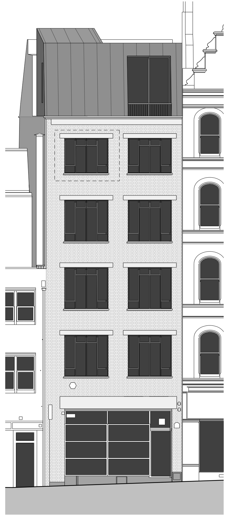
03 (00)300 No 19 Denmark Street Interbal lightwell elevation 1:100