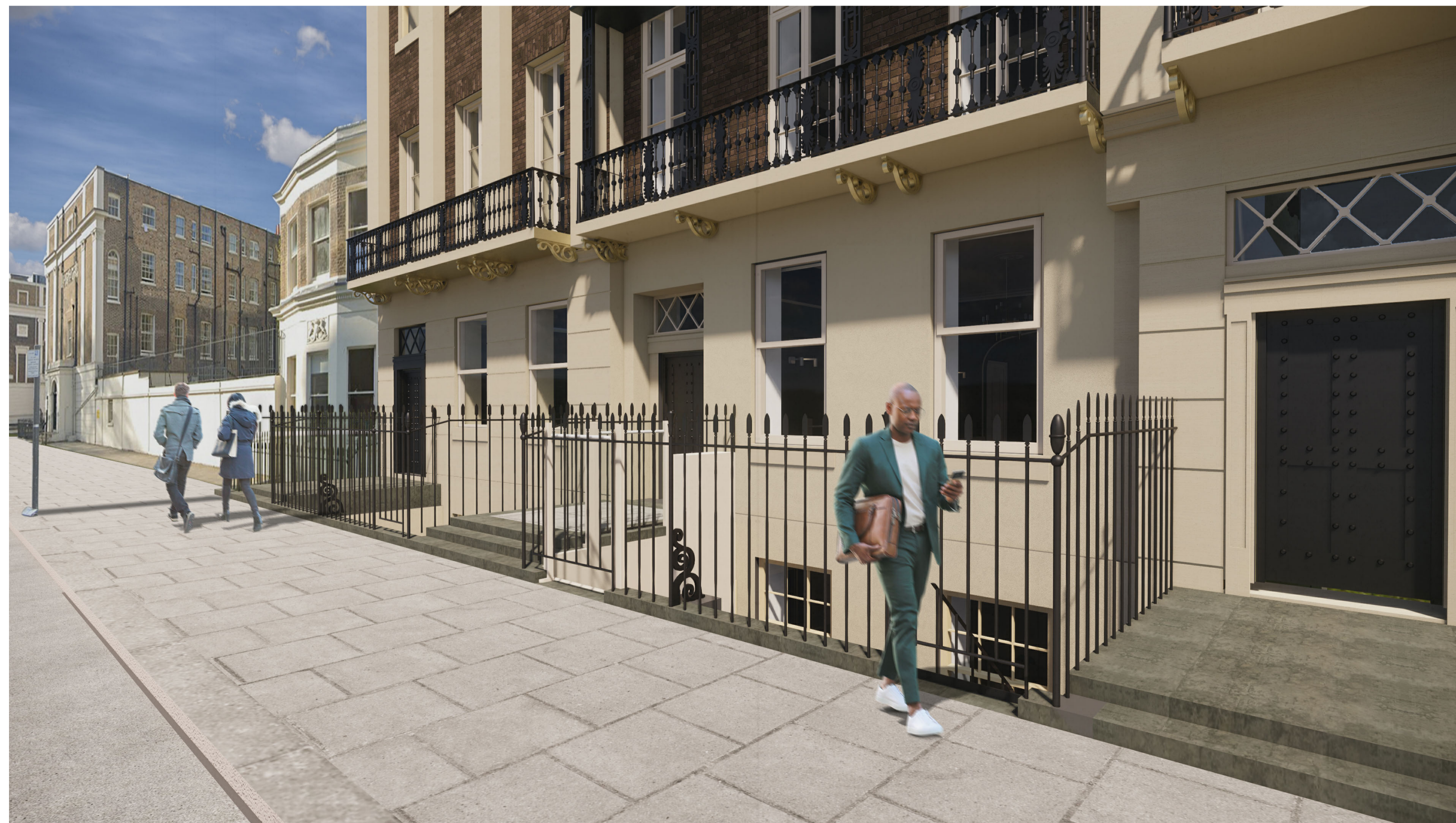
VIEW APPROACHING BUILDING FROM NORTH END OF ENDSLEIGH STREET