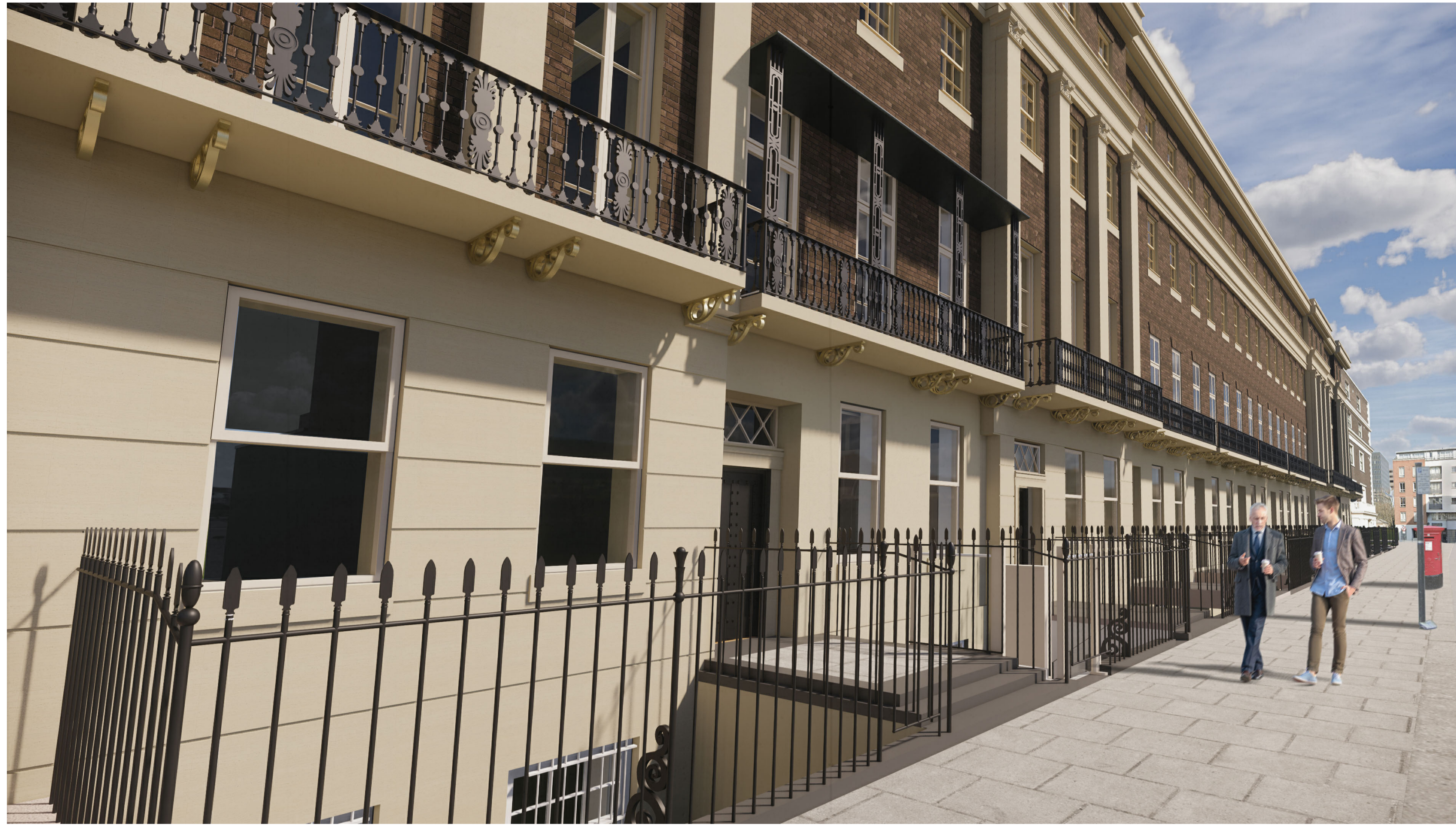
VIEW APPROACHING BUILDING FROM SOUTH END OF ENDSLEIGH STREET