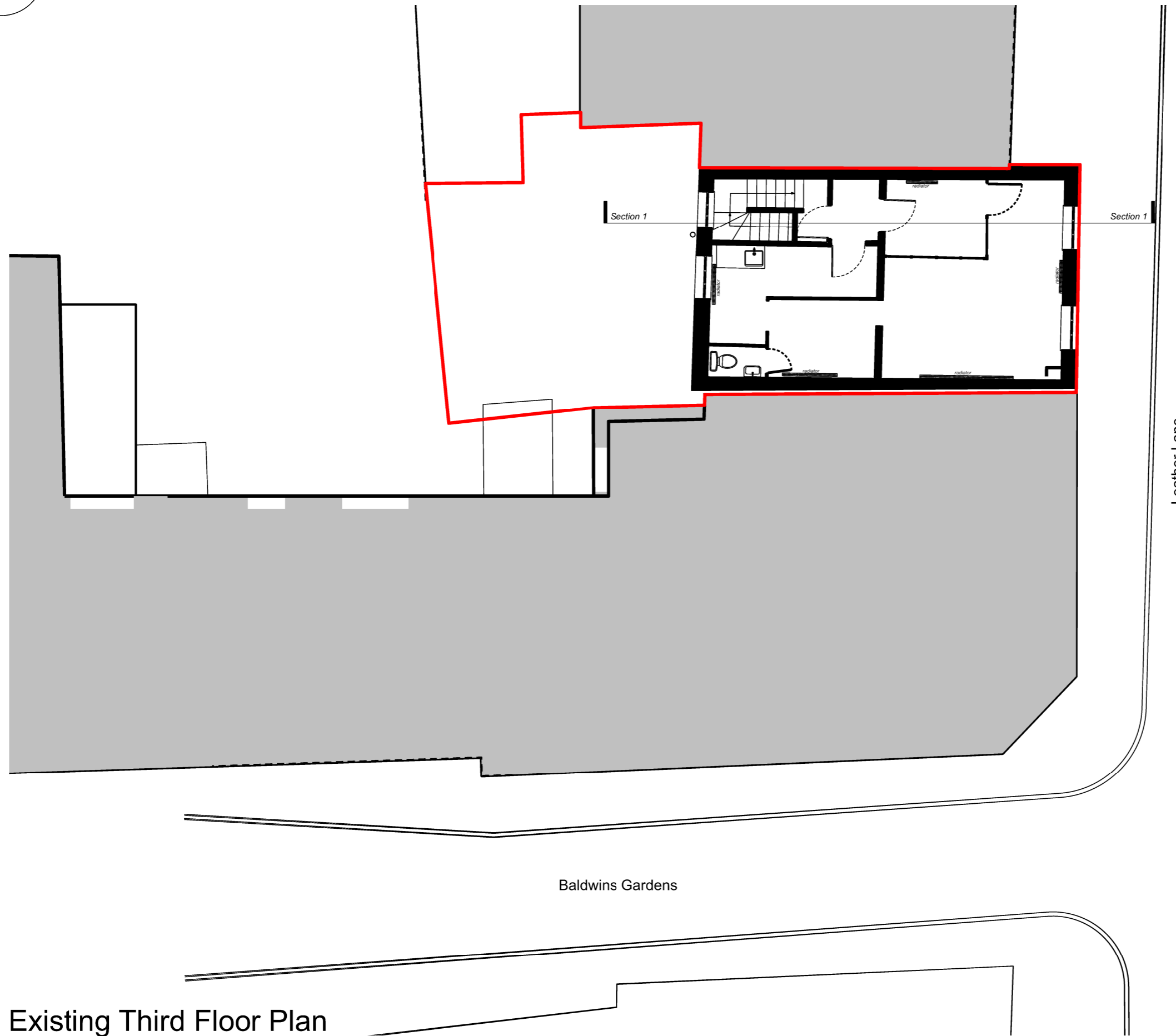
Existing Third Floor Plan