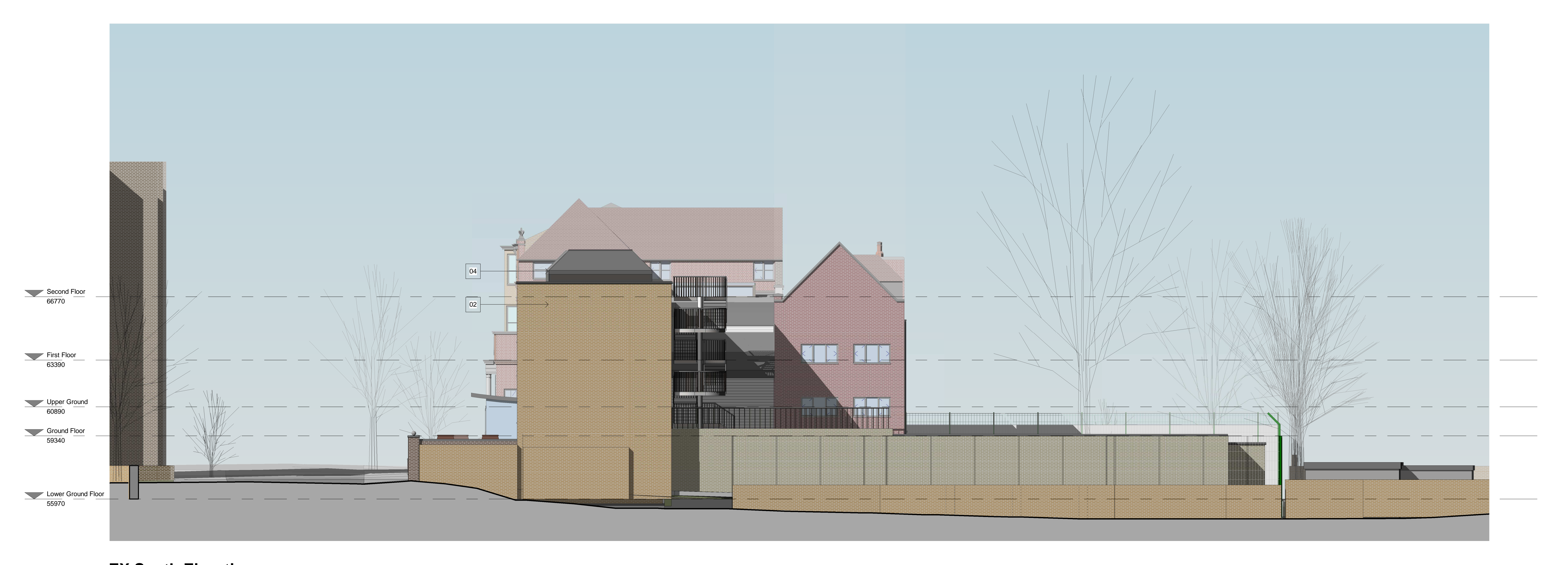
EX South Elevation