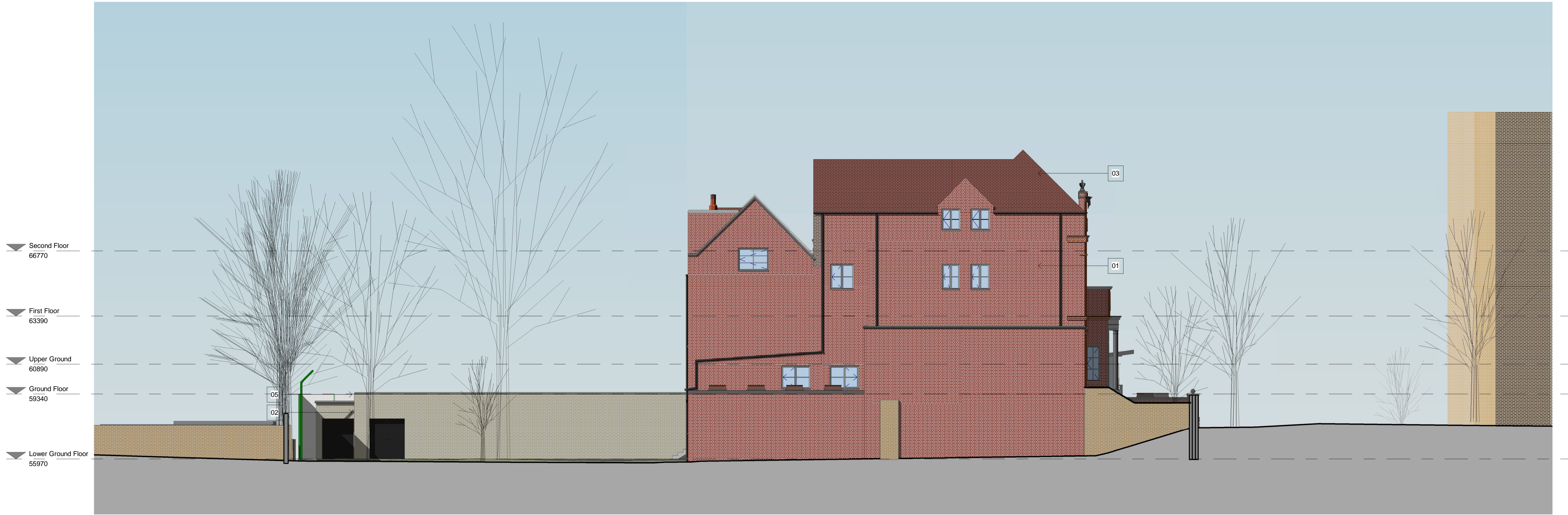
EX North Elevation 1 : 100