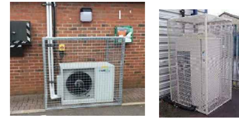
TYPICAL PLANT COMPOUND