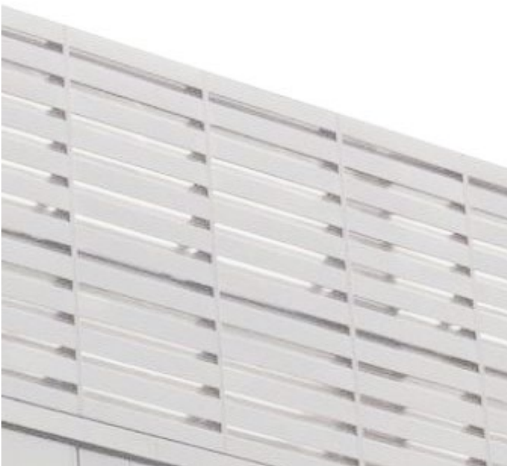
Acustic Louvres, windows and door frames, window reveals Plain colour RAL 7047

New windows in existing brick elevation at 1st floor to match the colour of the existing windows as image below.