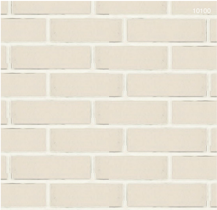
Wienerberger brick in stack bond Plain colour 10100 White mortar