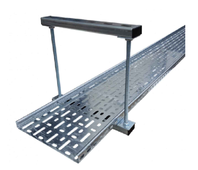
Fig 3 - TYPICAL DETAIL 150MM TRAY SUPPORT