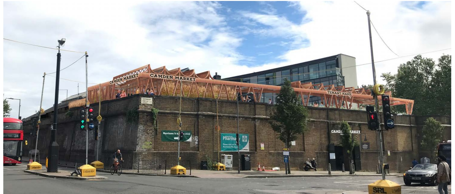
Visualisation in the day

The proposal will remove the existing structure that detracts from the listed building and conservation area, and will replace it with a new structure that will add to and support the vitality and the function of the site and the wider Stables Market by introducing architecture that celebrates the heritage environment and enables an appropriate use for the site given its town centre location.