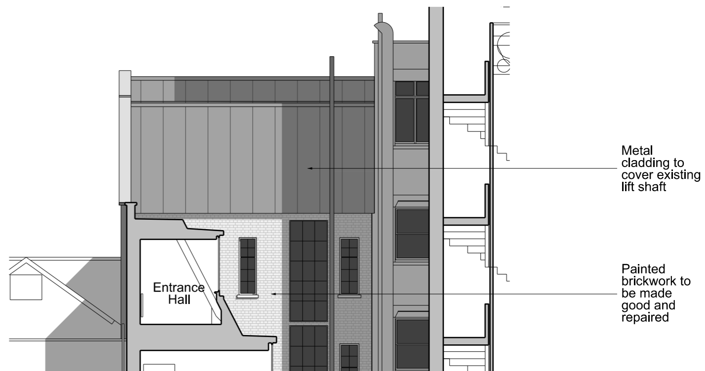
03 Proposed 00_240 Cross Section 2 1:100