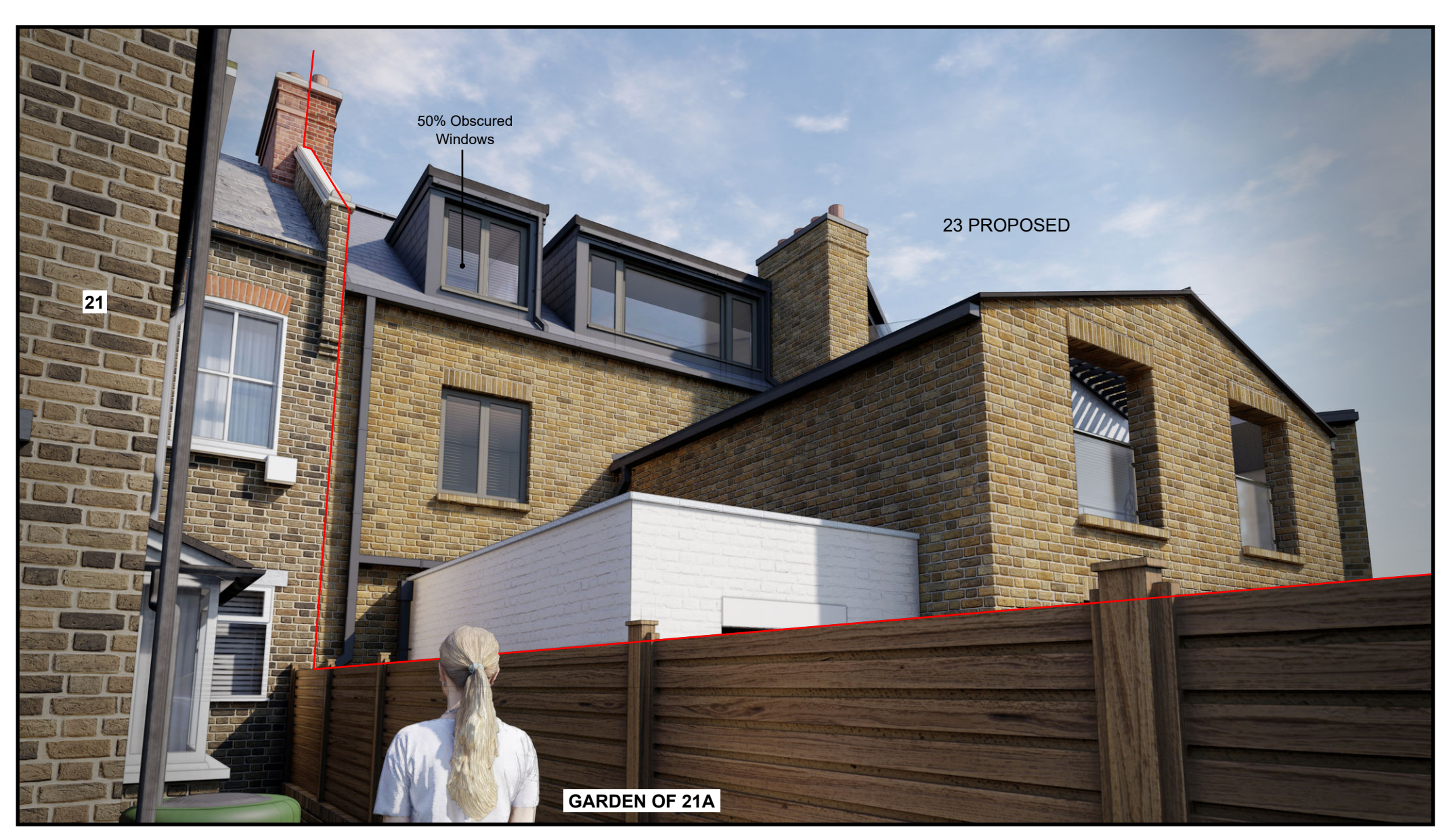
View of the proposed development from the rear garden of No.21A, close to the house.