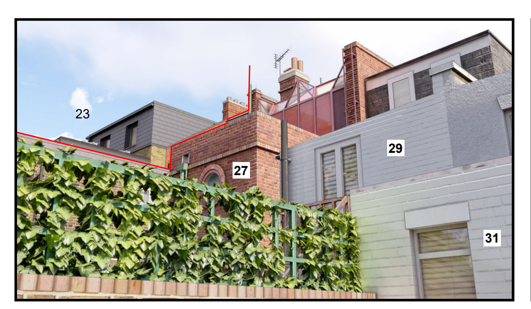
GCI view of the proposed scheme from the garden of No.31.