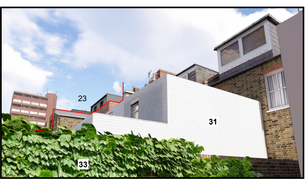
GCI view of the proposed scheme from the garden of No.33.