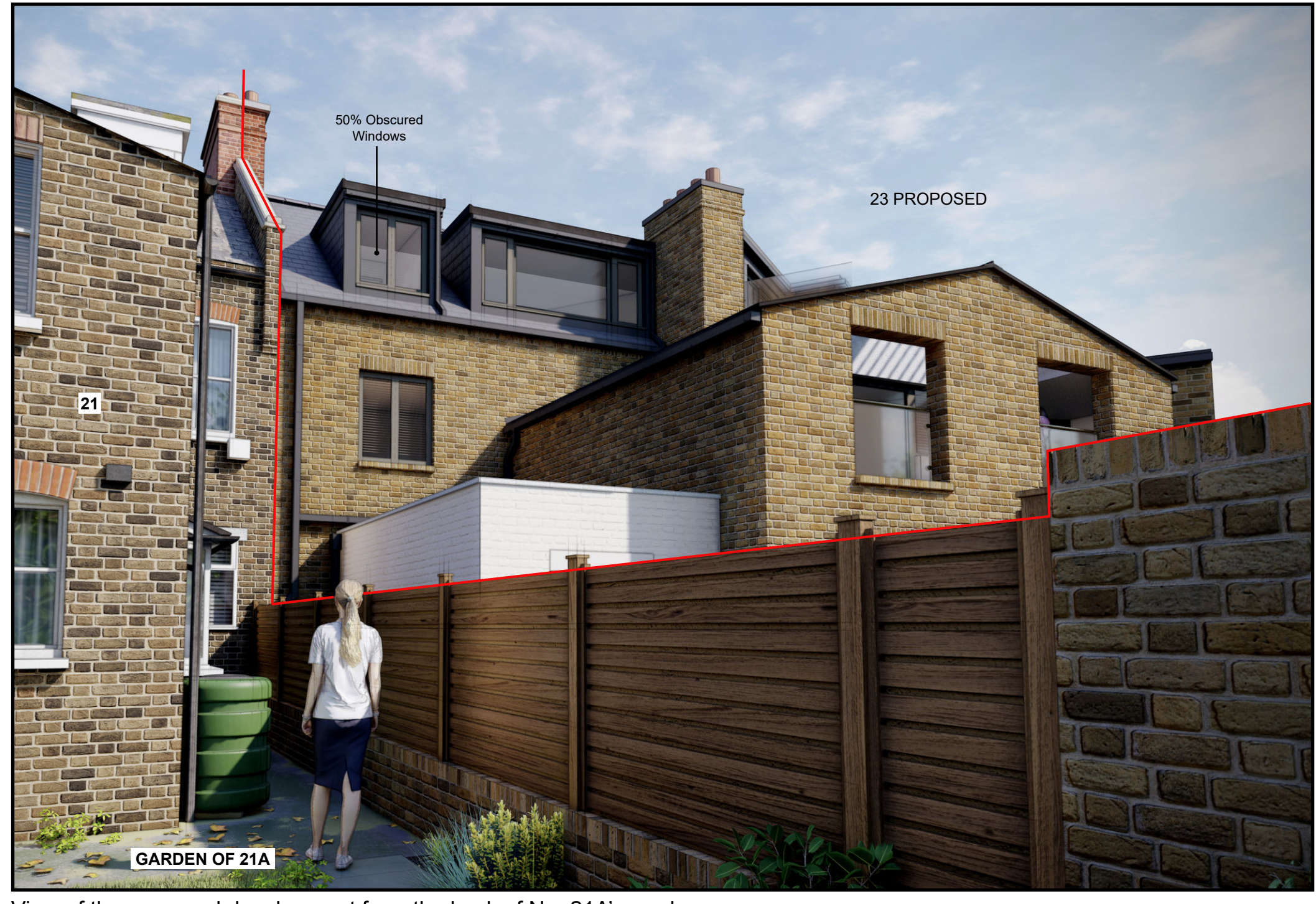
View of the proposed development from the back of No. 21A's garden.