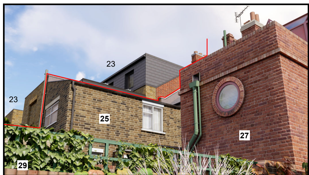
GCI view of the proposed scheme from the garden of No.29.