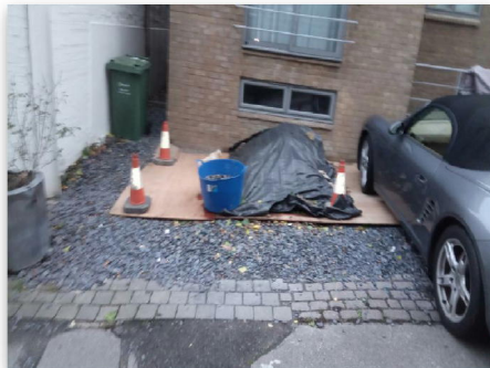
Fig 1.1: Trial Hole 1 Location