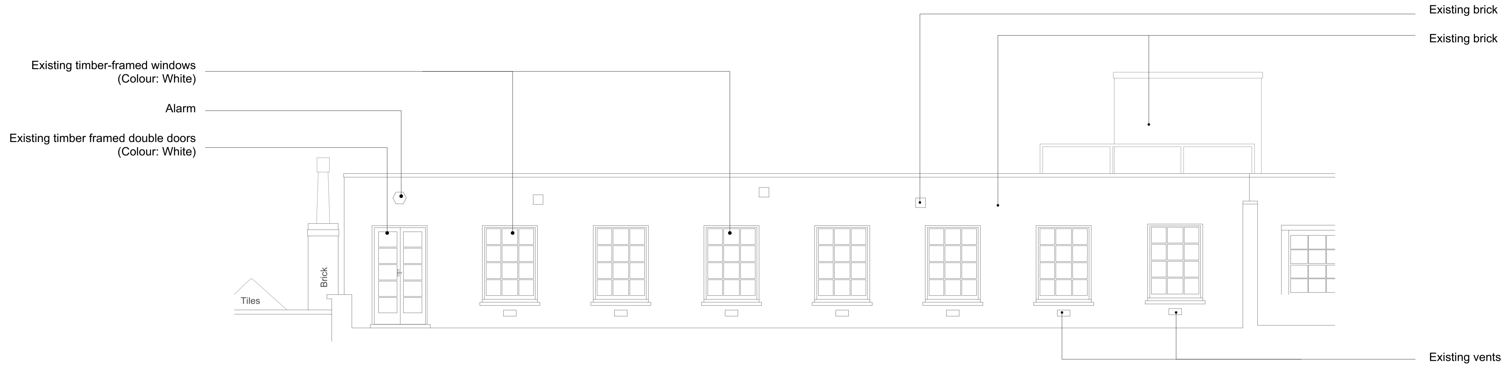
A Existing Front Elevation - Fourth Floor Scale 1:20@A1