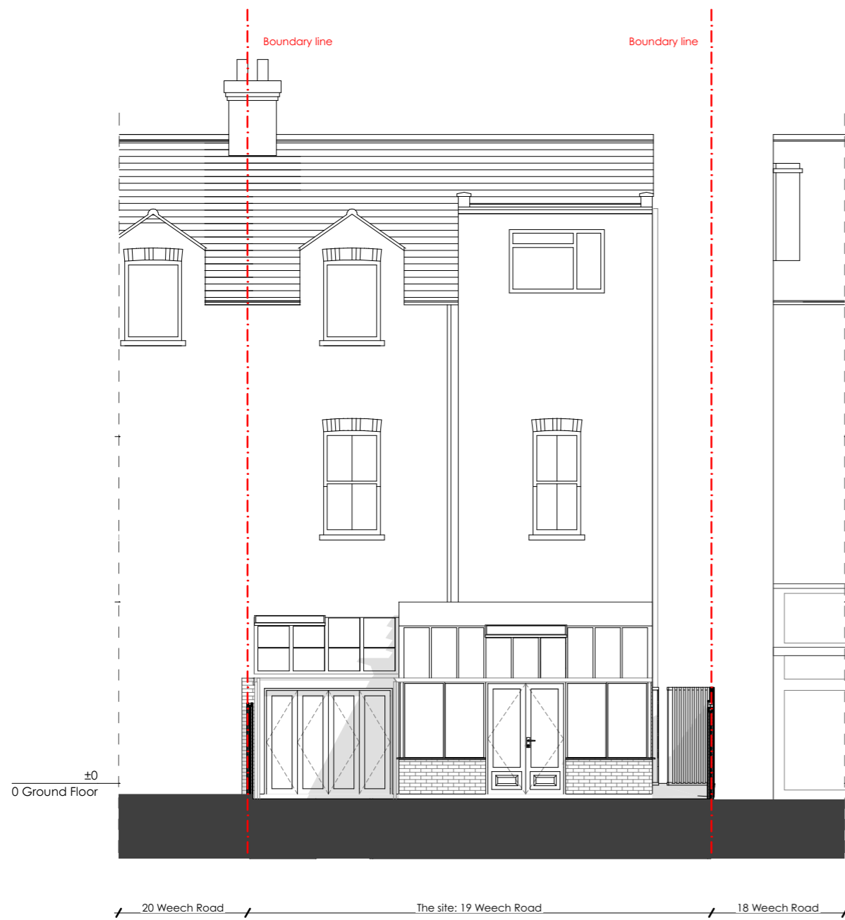
EXISTING REAR ELEVATION E-01 SCALE 1:100