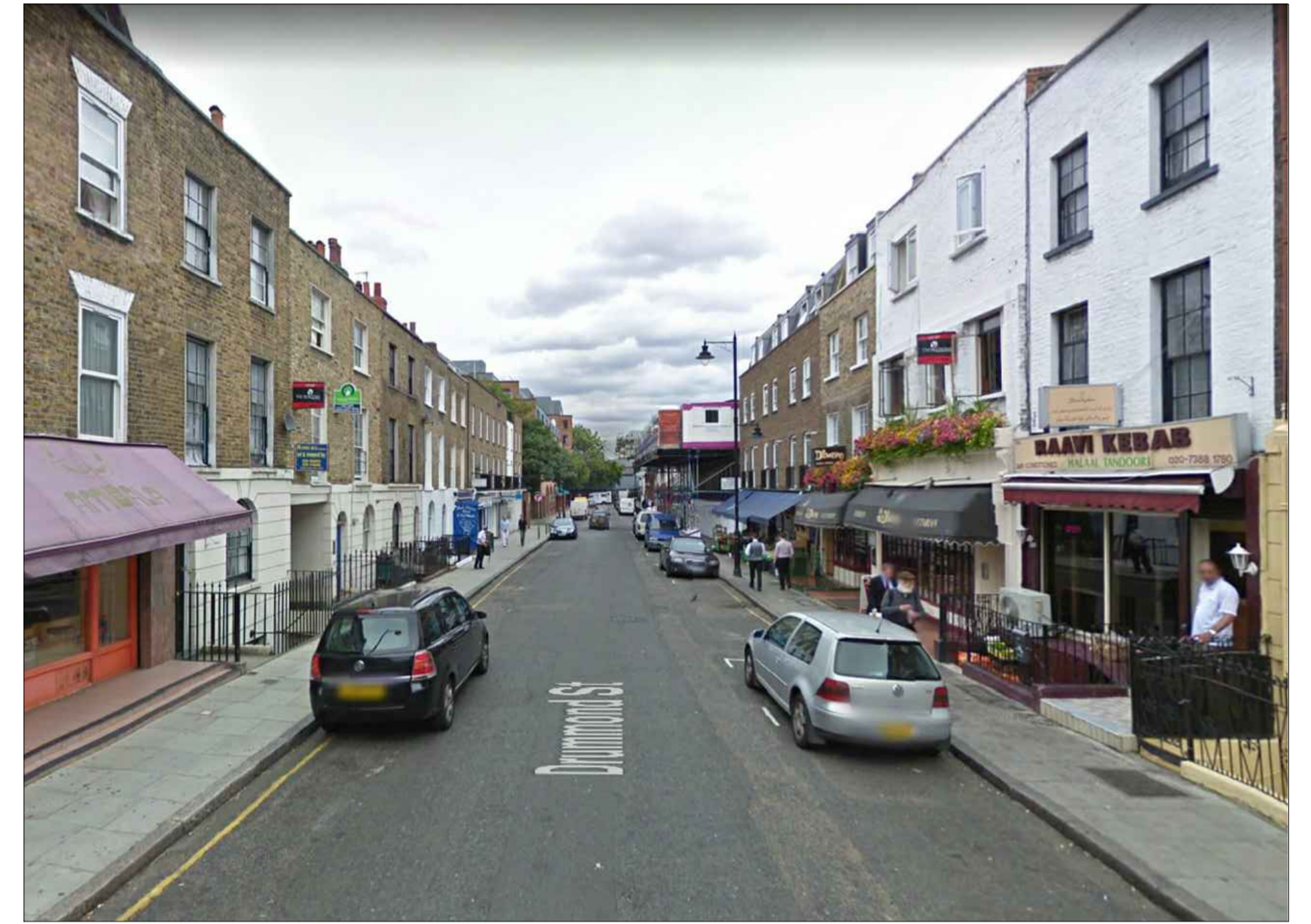
3 Existing Street View