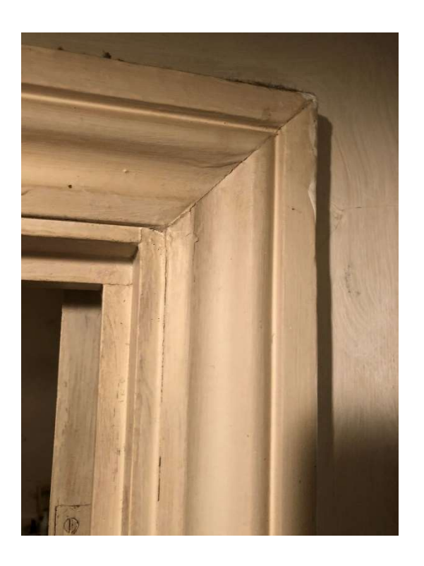
Internal door surround

7. There are no cornices at the junctions between walls and ceilings.