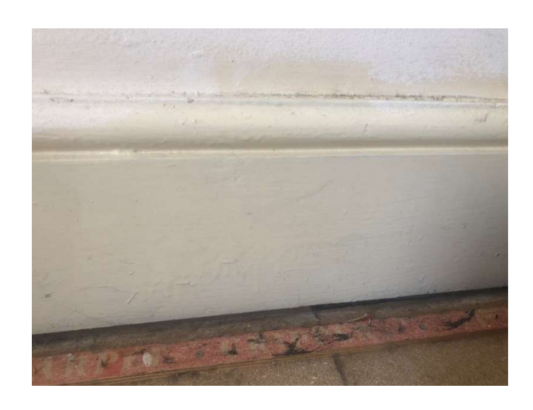
Existing skirtings to external walls & party walls