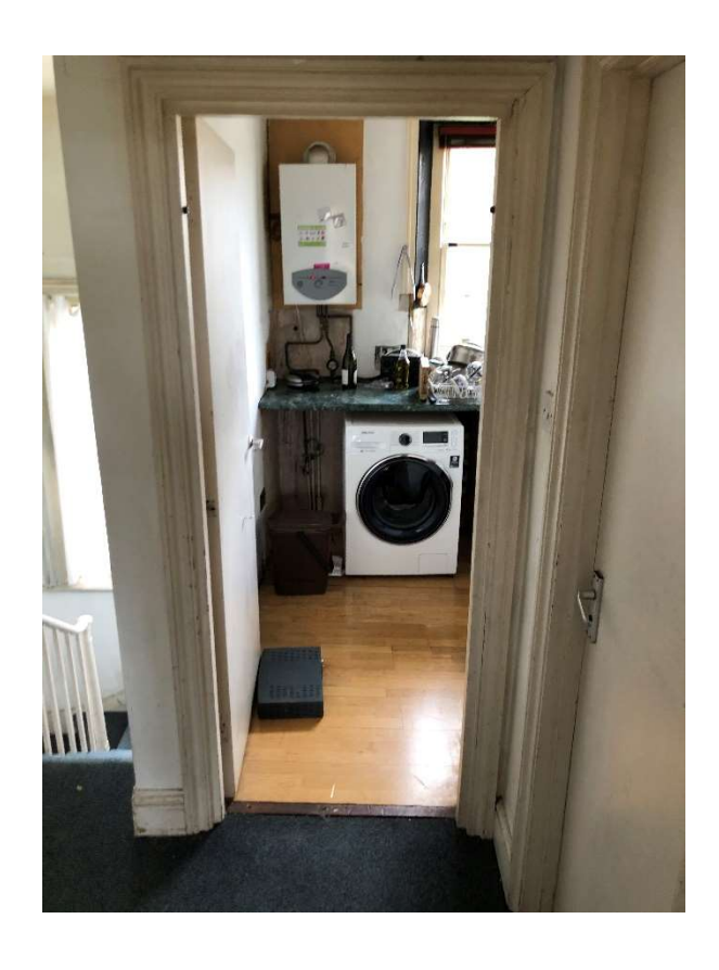
Existing doors onto landing area

5. All internal doors are modern flush doors