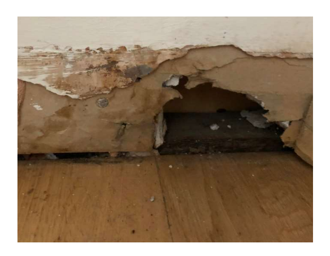
Base of stud wall showing plasterboard construction

4. All internal partition walls are modern stud construction comprising plasterboard linings on a timber frame. There are no plaster and lathe partition walls. The walls forming the upper stairwell/landing area are also stud partition walls.