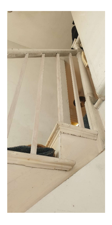
Existing staircase string, balustrade and handrail detail

1. The existing staircase leading up to the studio flat appears to be an original feature of the property (see photograph below). This staircase will therefore remain in place.