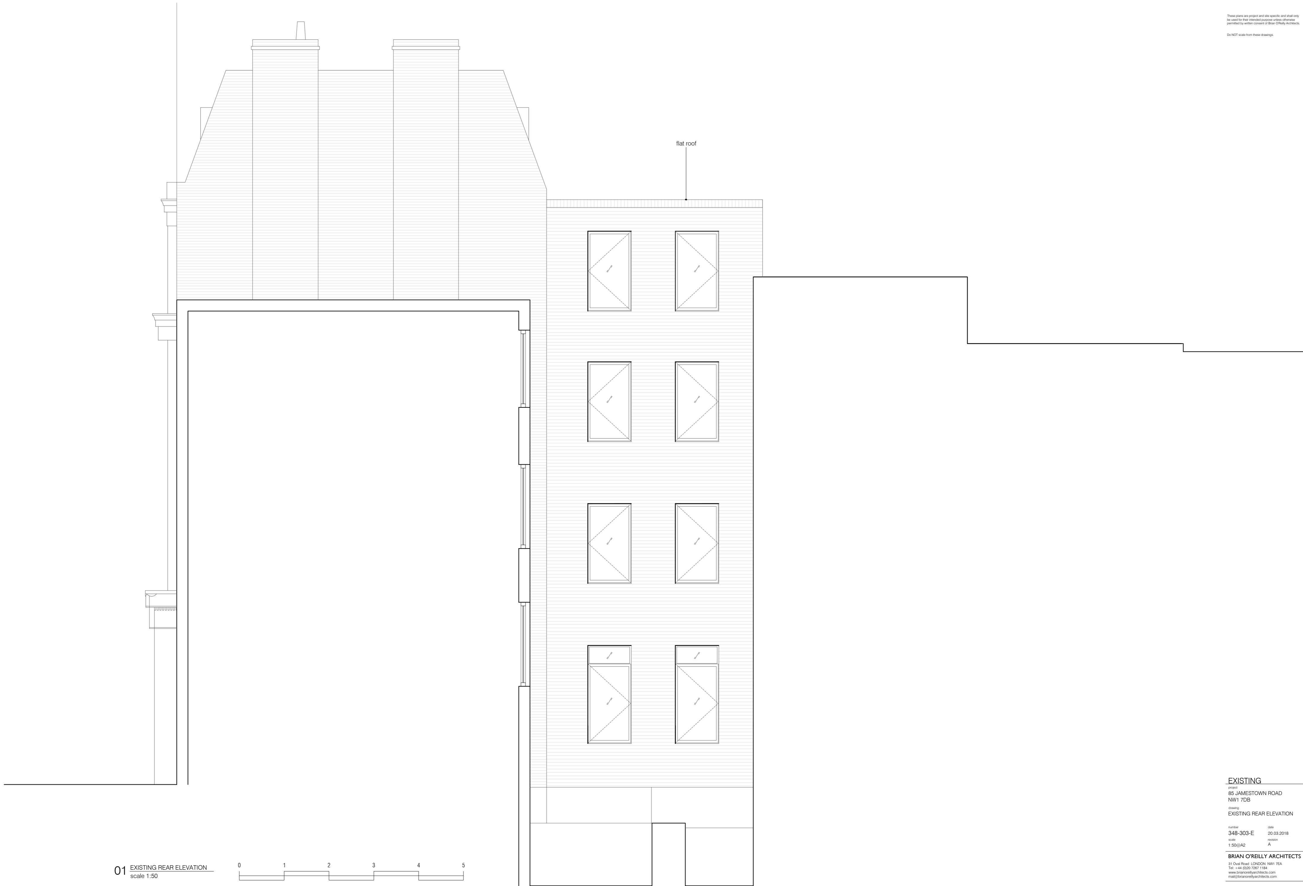
01 EXISTING REAR ELEVATION scale 1:50