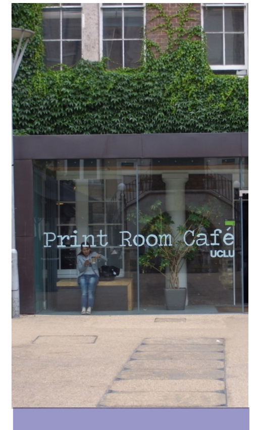
SU Print Room Cafe