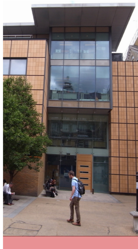
Arts & Humanites