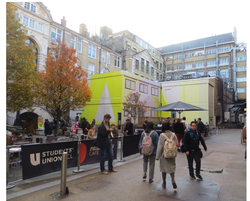
Existing building looking towards Anatomy