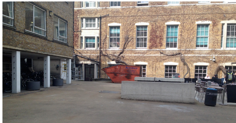
Site looking towards South Wing