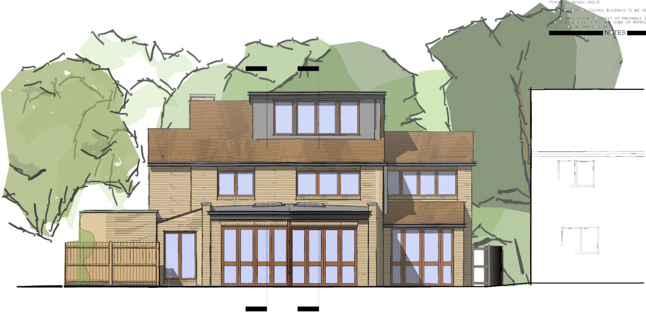
Proposed Rear Elevation 1 : 100