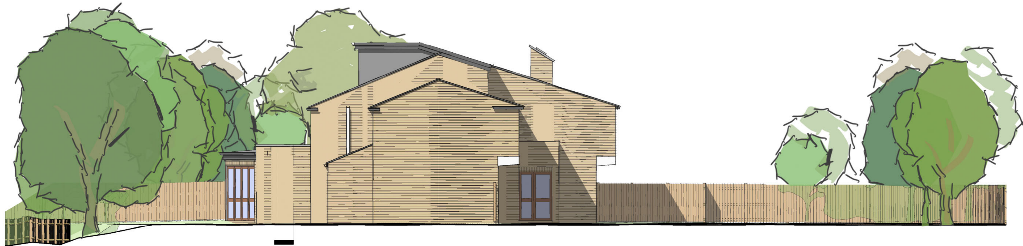
Proposed South-West Elevation 1 : 100