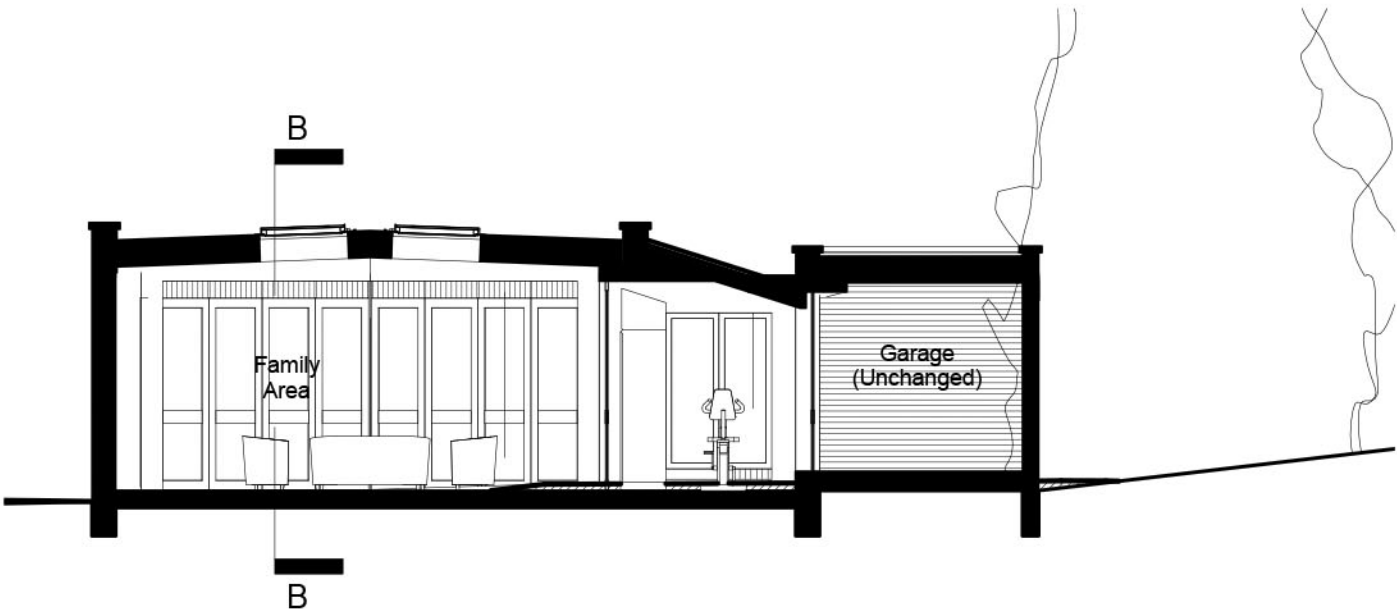
Section CC as Proposed 1 : 100