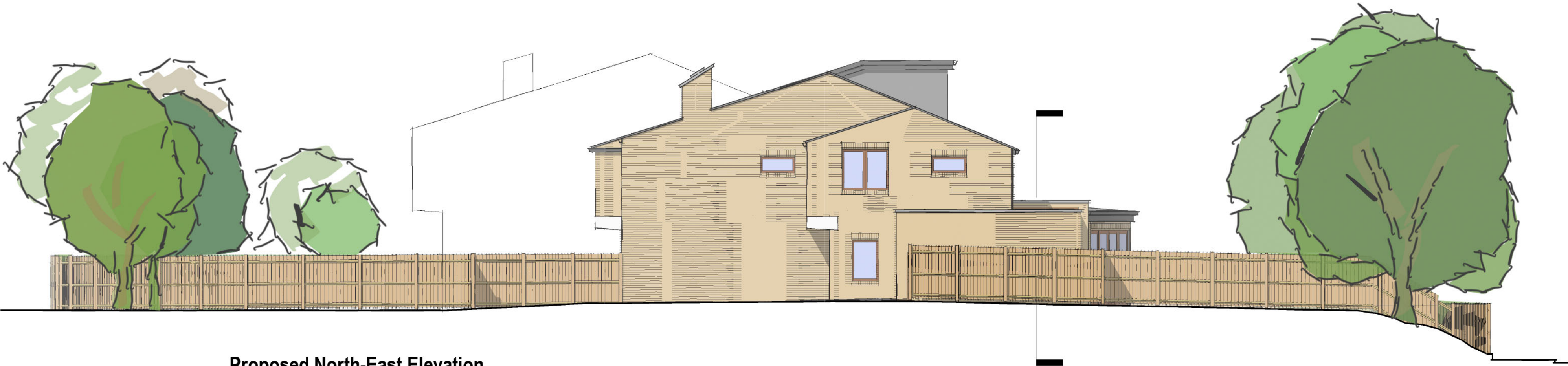
Proposed North-East Elevation 1 : 100

THIS DRAWING IS A PRINT AND MUST NOT BE SCALED. ANY QUERIES REGARDING DIMENSIONS TO BE TAKEN UP WITH PENTANGLE DESIGN GROUP. ALL DIMENSIONS OF EXISTING BUILDINGS TO BE VERIFIED ON SITE. THIS DRAWING IS THE COPYRIGHT OF PENTANGLE DESIGN GROUP AND SHALL NOT BE IN ANY WAY USED OR REPRODUCED WITHOUT THEIR PRIOR WRITTEN CONSENT.