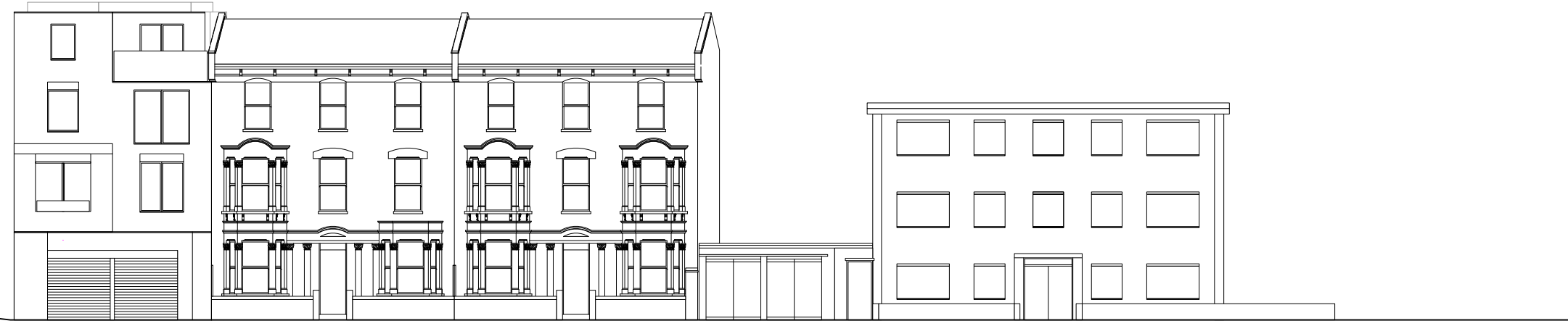
2 PROPOSED STREET ELEVATION - AGAR GROVE 1:200@A3