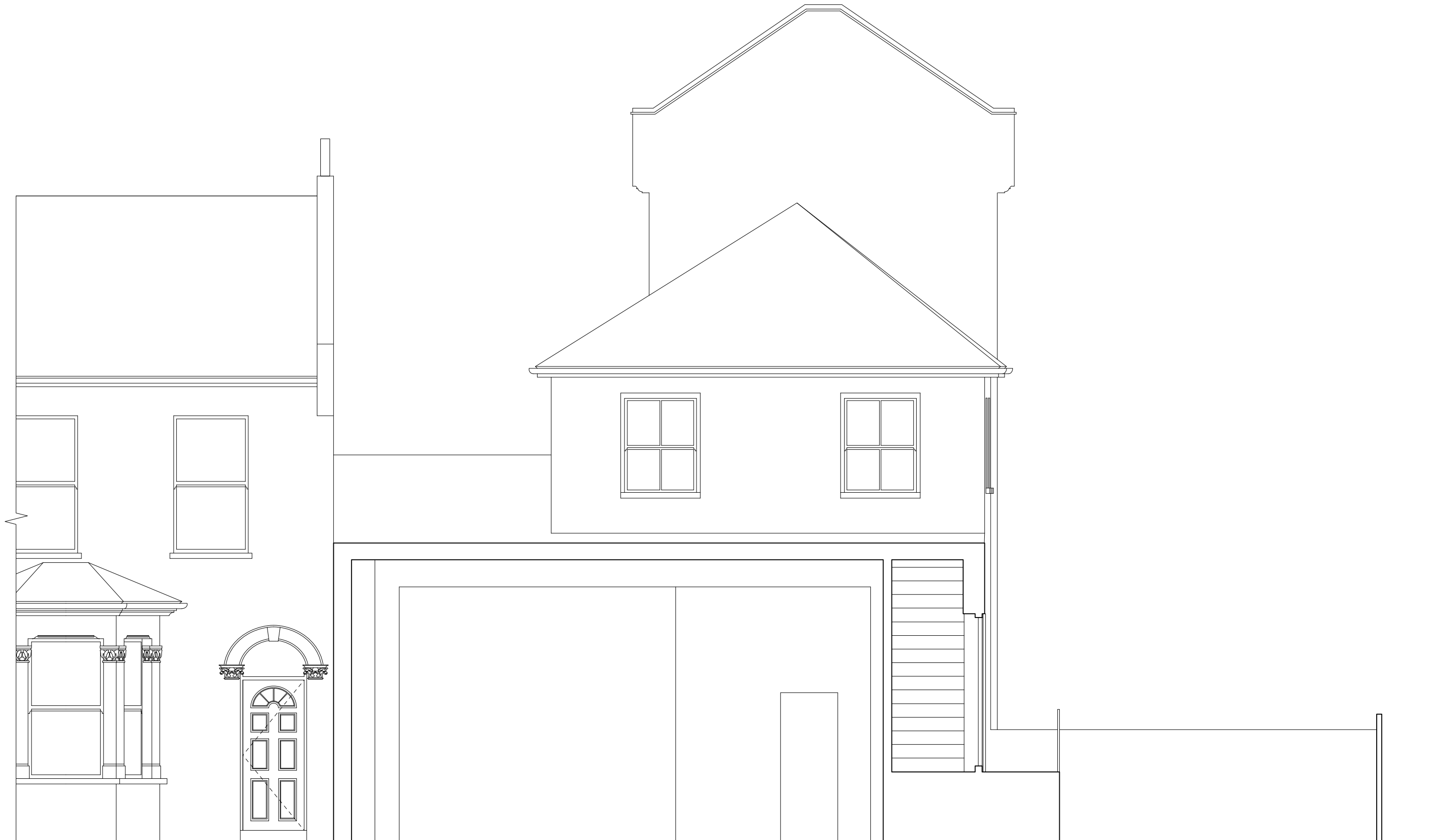
1 EXISTING SECTION B-B 1:50@A3