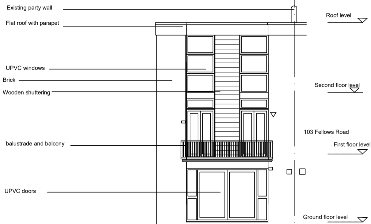
Rear (South) Elevation