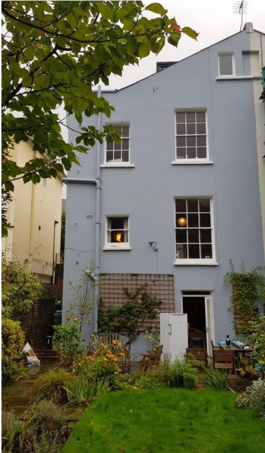
4. Rear elevation