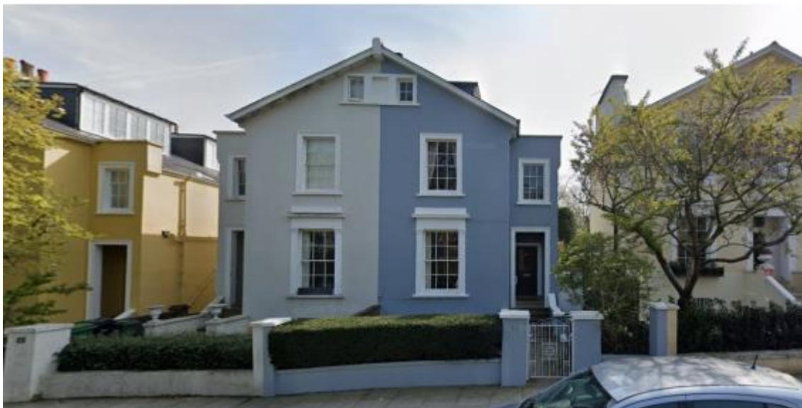
2. Street elevation