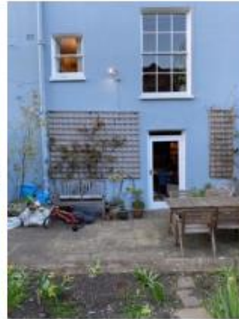
Left: Timber staircase between upper and lower ground floors