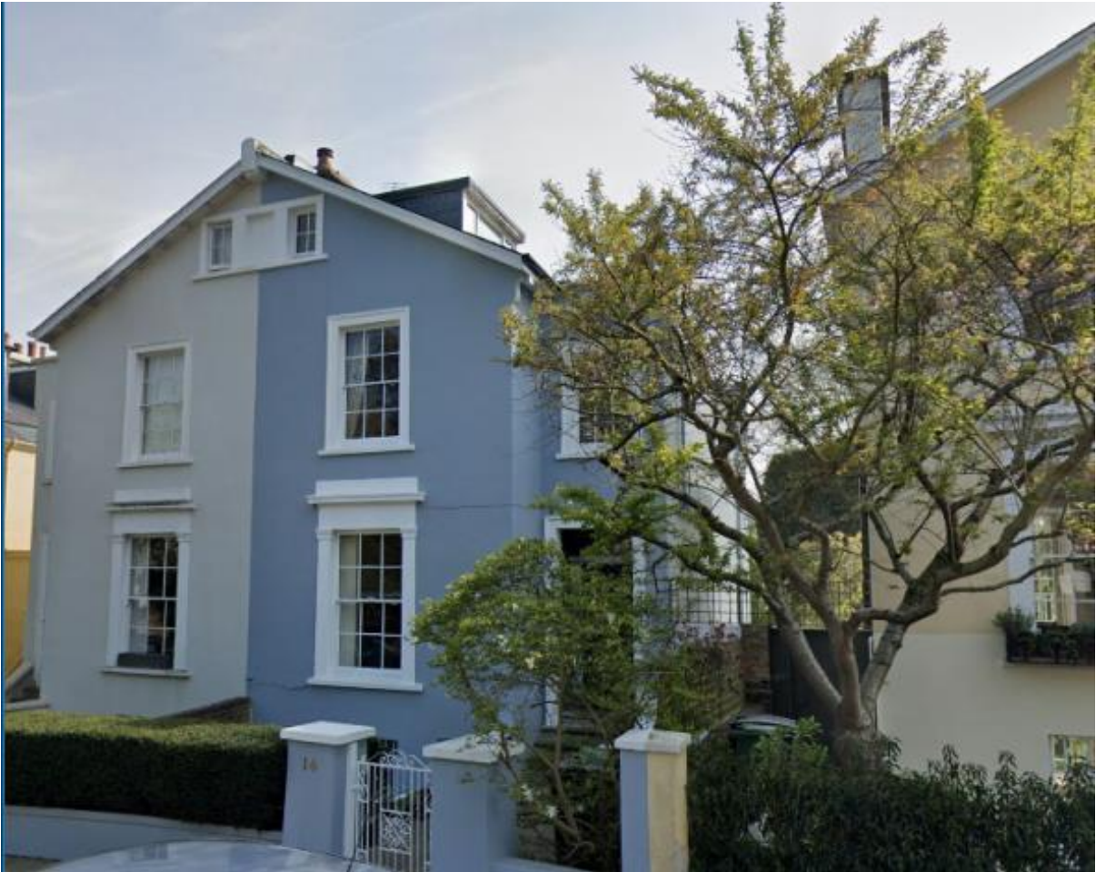
1. Front Elevation