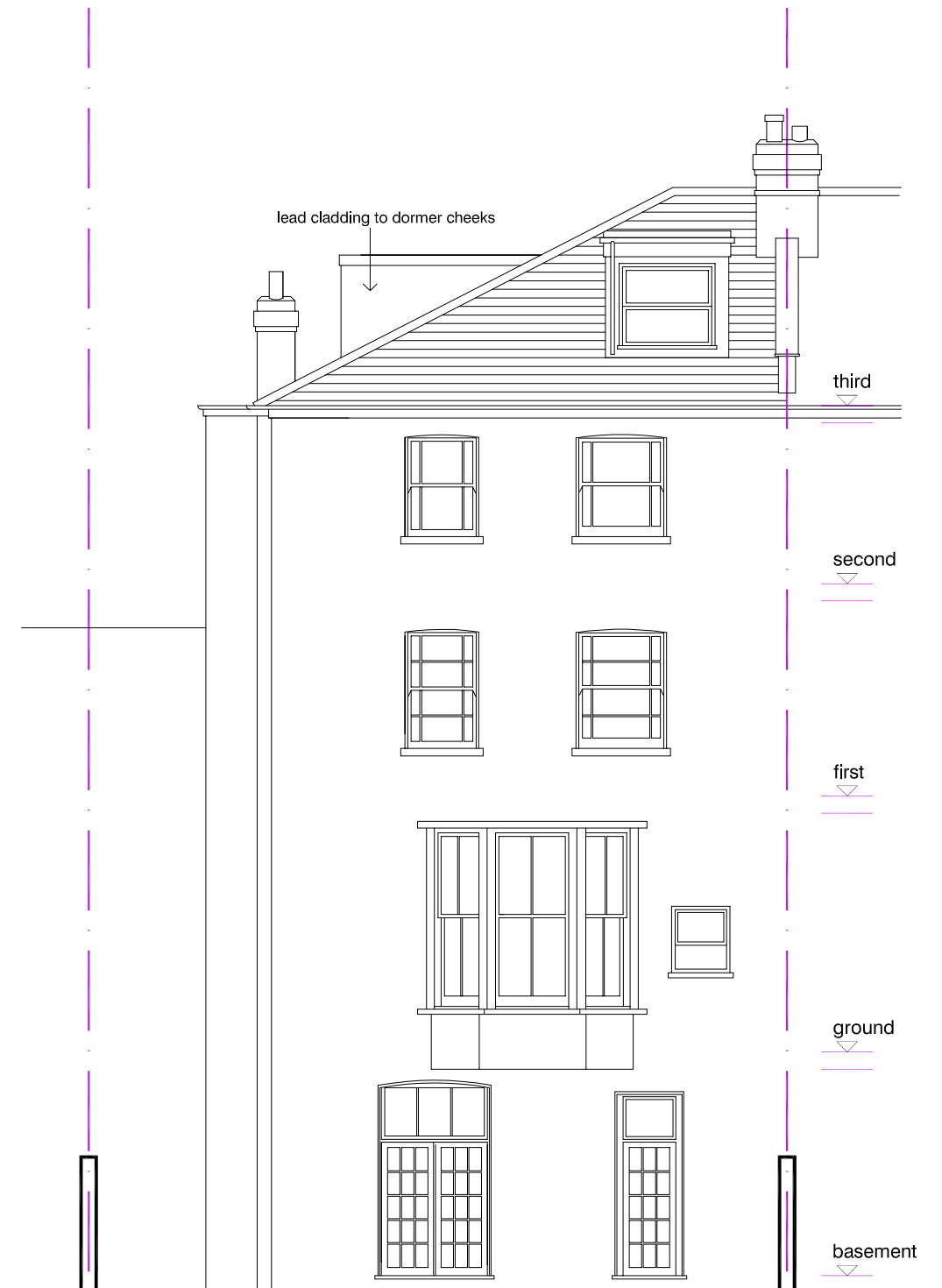
south elevation (rear)