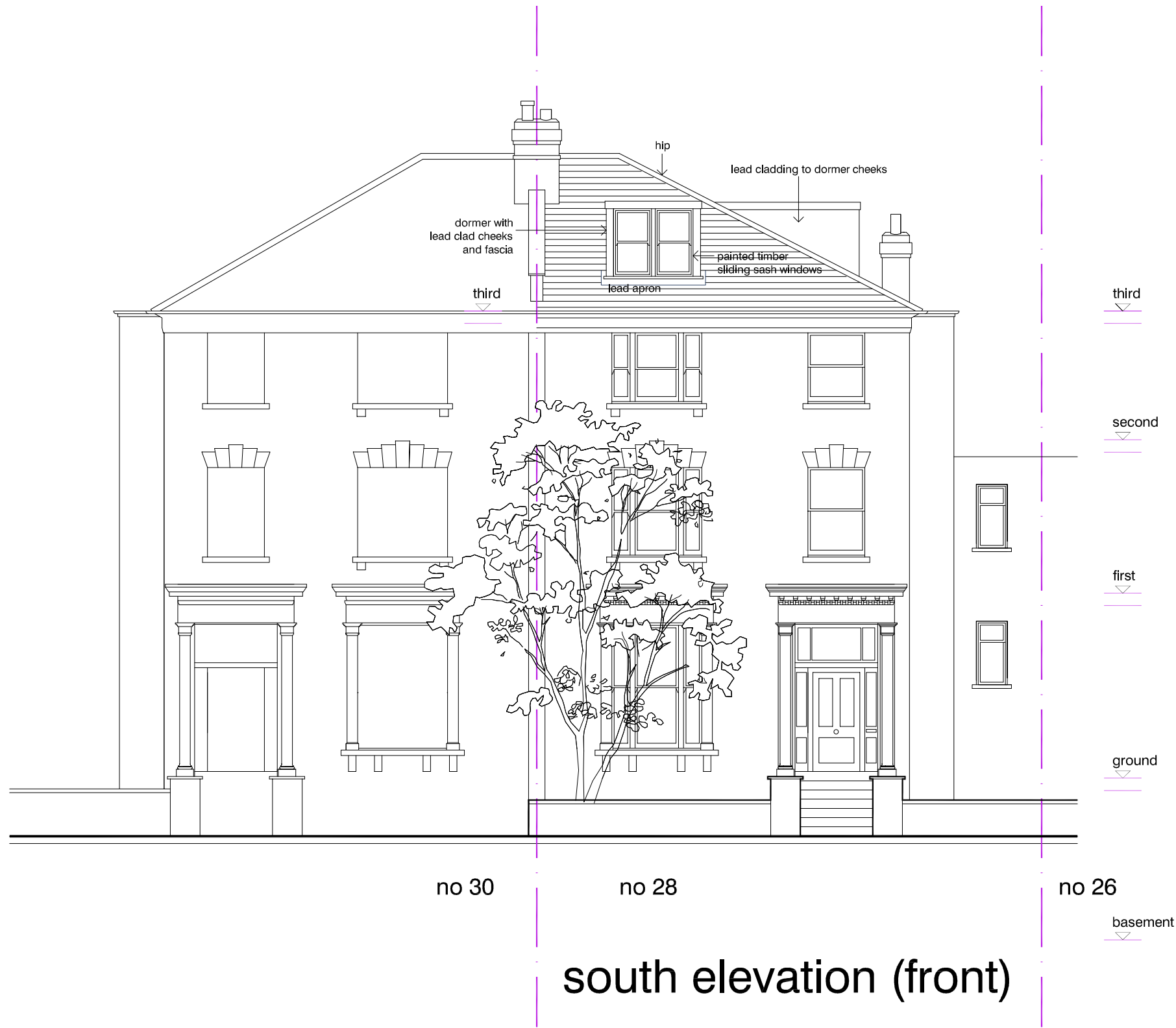
south elevation (front)