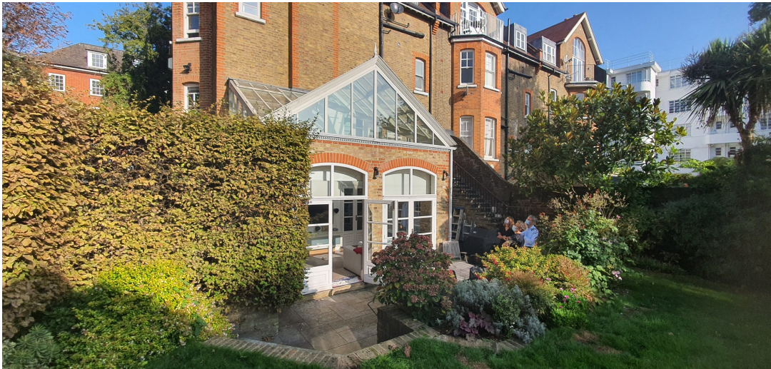
Garden view of 5 England's Lane NW3 4YA - https://goo.gl/maps/MmaEprVGqDtrUpPt8