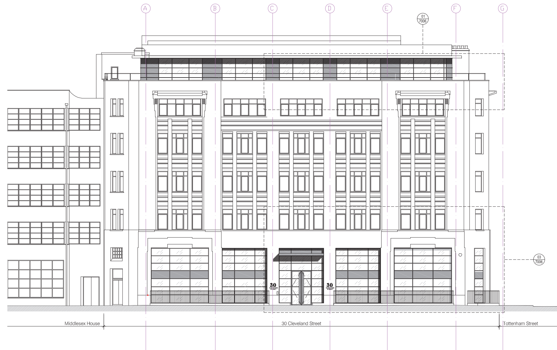
1 EXISTING SOUTH-WEST ELEVATION 1:100

BIM 360/Take Two Interactive/T2I-PWA-ZZ-00-DR-I-7004