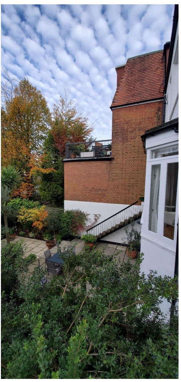
A view from the bay window at the ground floor of flat 2 to the rear garden and existing stair at no. 5.