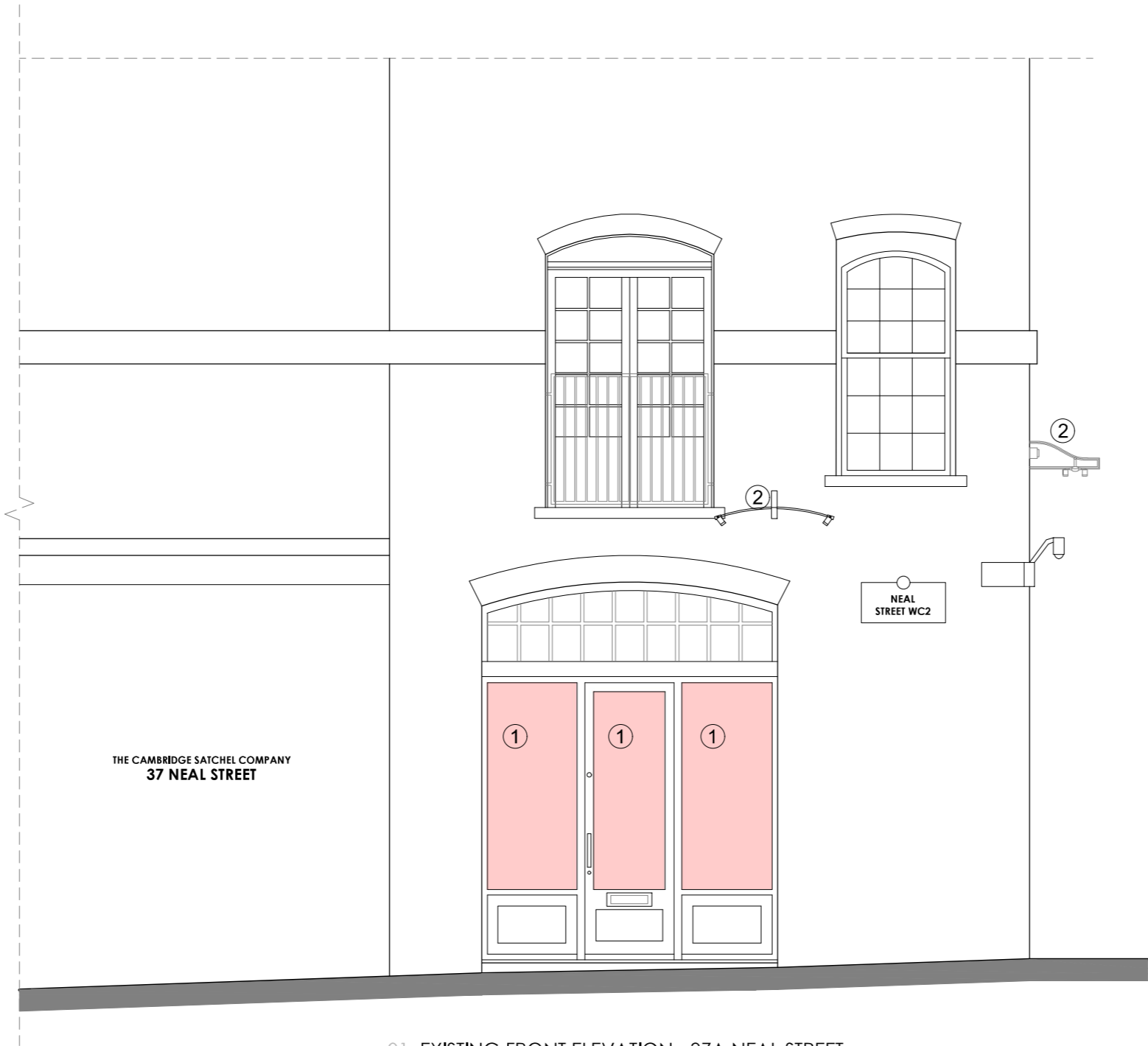
01 EXISTING FRONT ELEVATION - 37A NEAL STREET 1:50

This drawing is copyright and may not be reproduced in whole or part without written authority. Bishop & Associates does not accept liability for any deviation to our drawings or specification. All measurement subject to full measured survey.