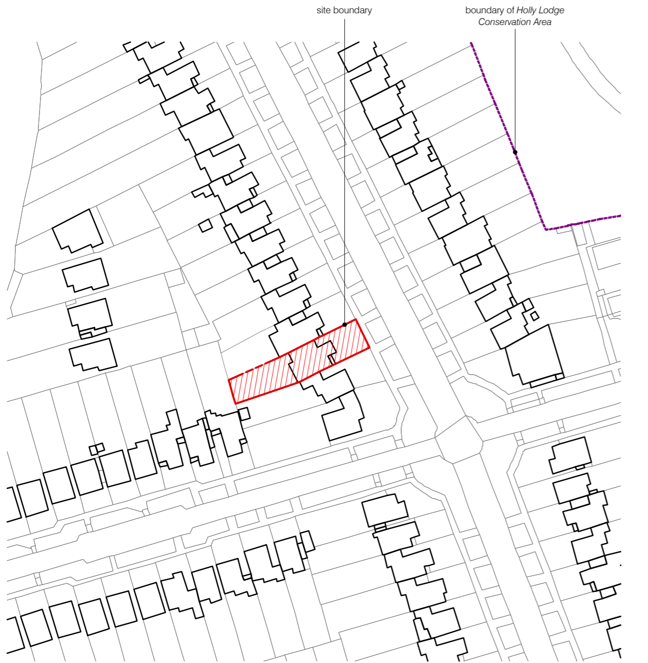
01 LOCATION PLAN scale 1:1250