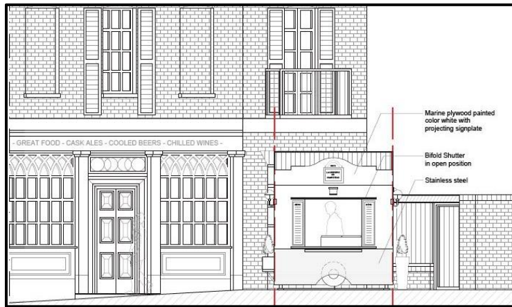
Fig. 3: Proposed replacement kiosk