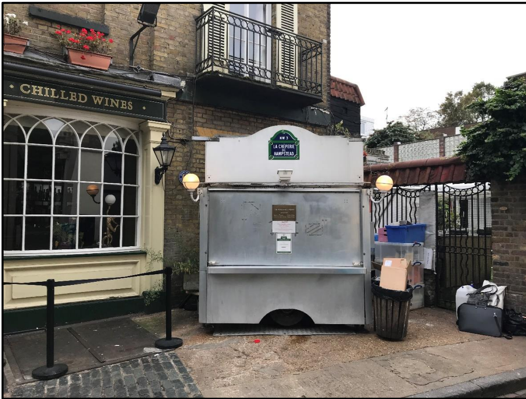
Fig. 2: Front elevation of the subject site at 77 Hampstead High Street