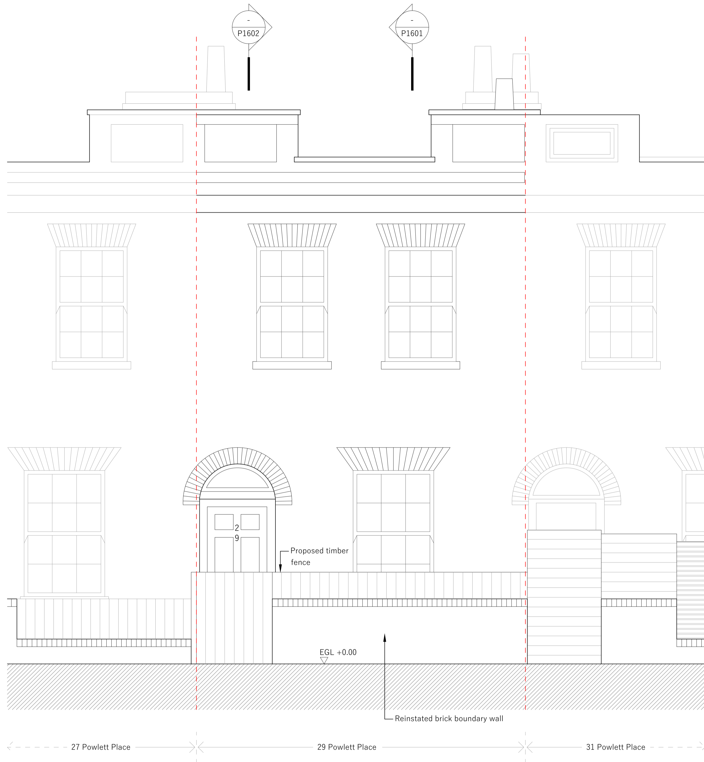
① Short section through Powlett Place looking North