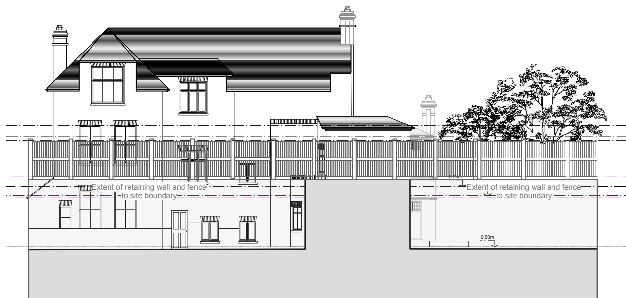
Revised proposal: North East elevation 1:200 @ A3