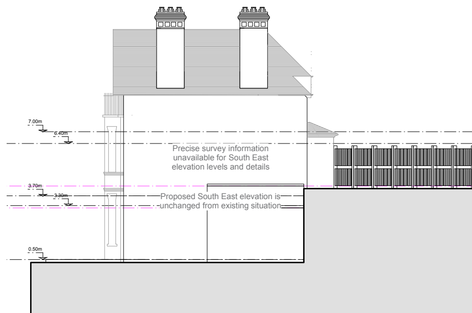
Revised proposal: South East elevation 1:200 @ A3