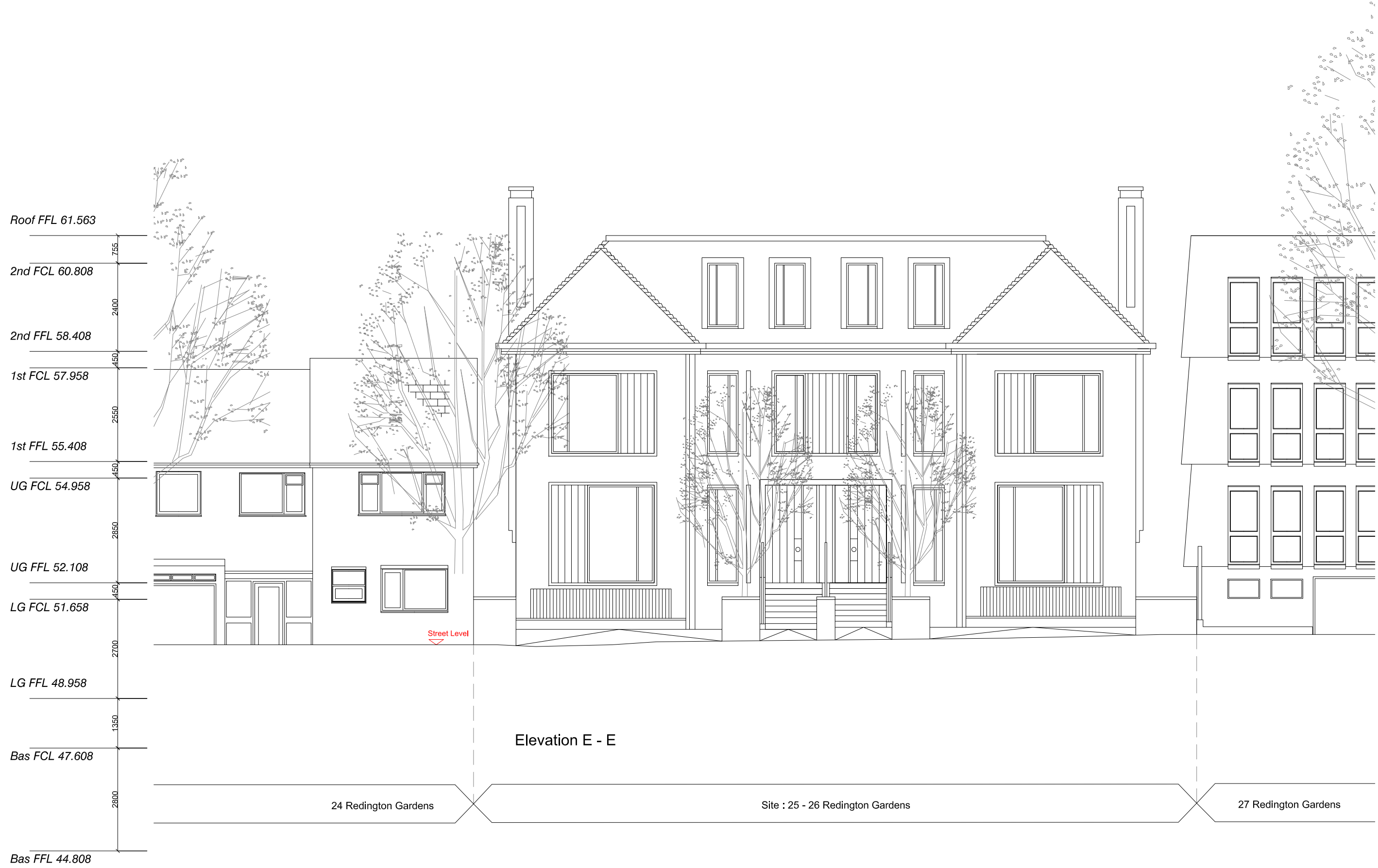
Elevation E - E