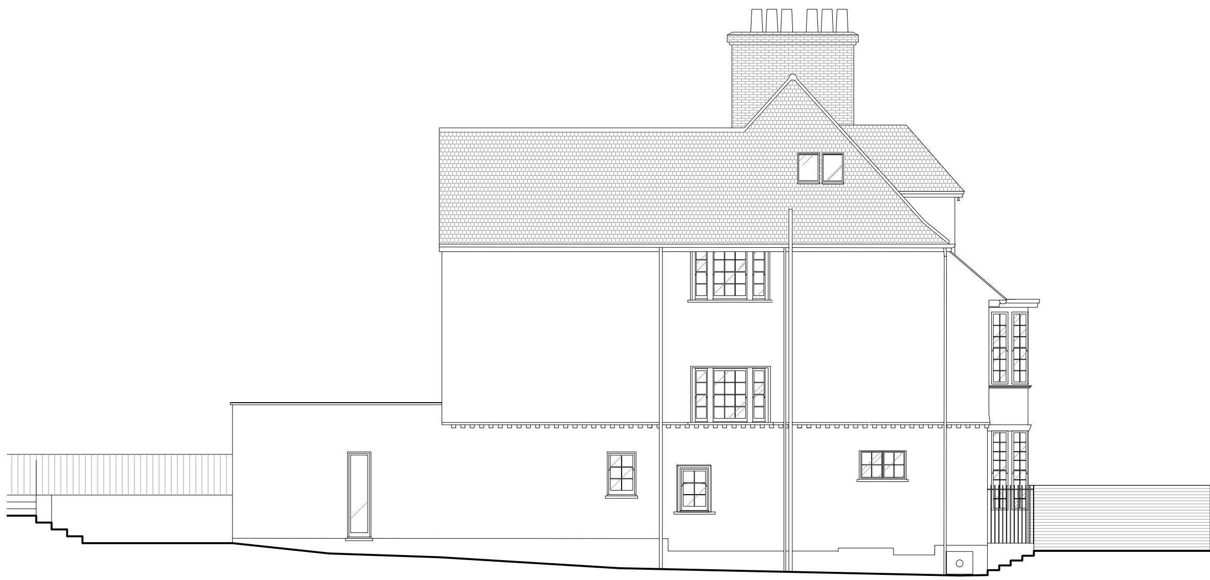
1 EXISTING SIDE ELEVATION 1 scale 1:100

REVISIONS - PLANNING SUBMISSION DATE 17.11.2020