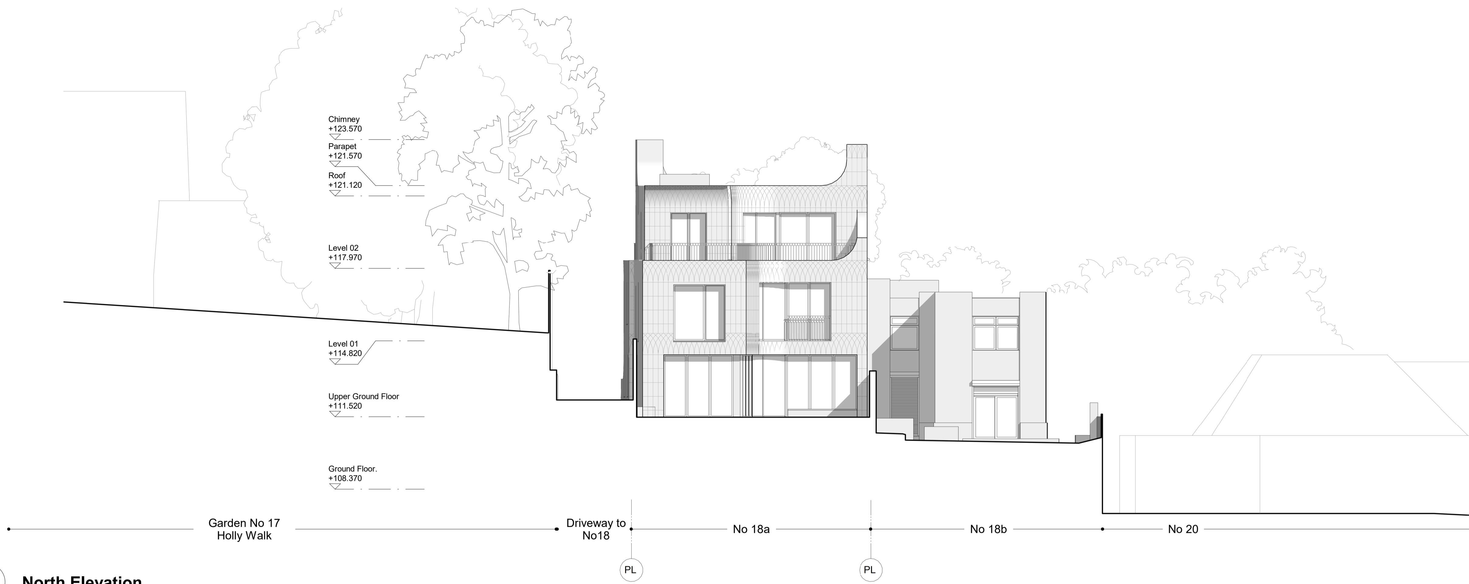
1 North Elevation