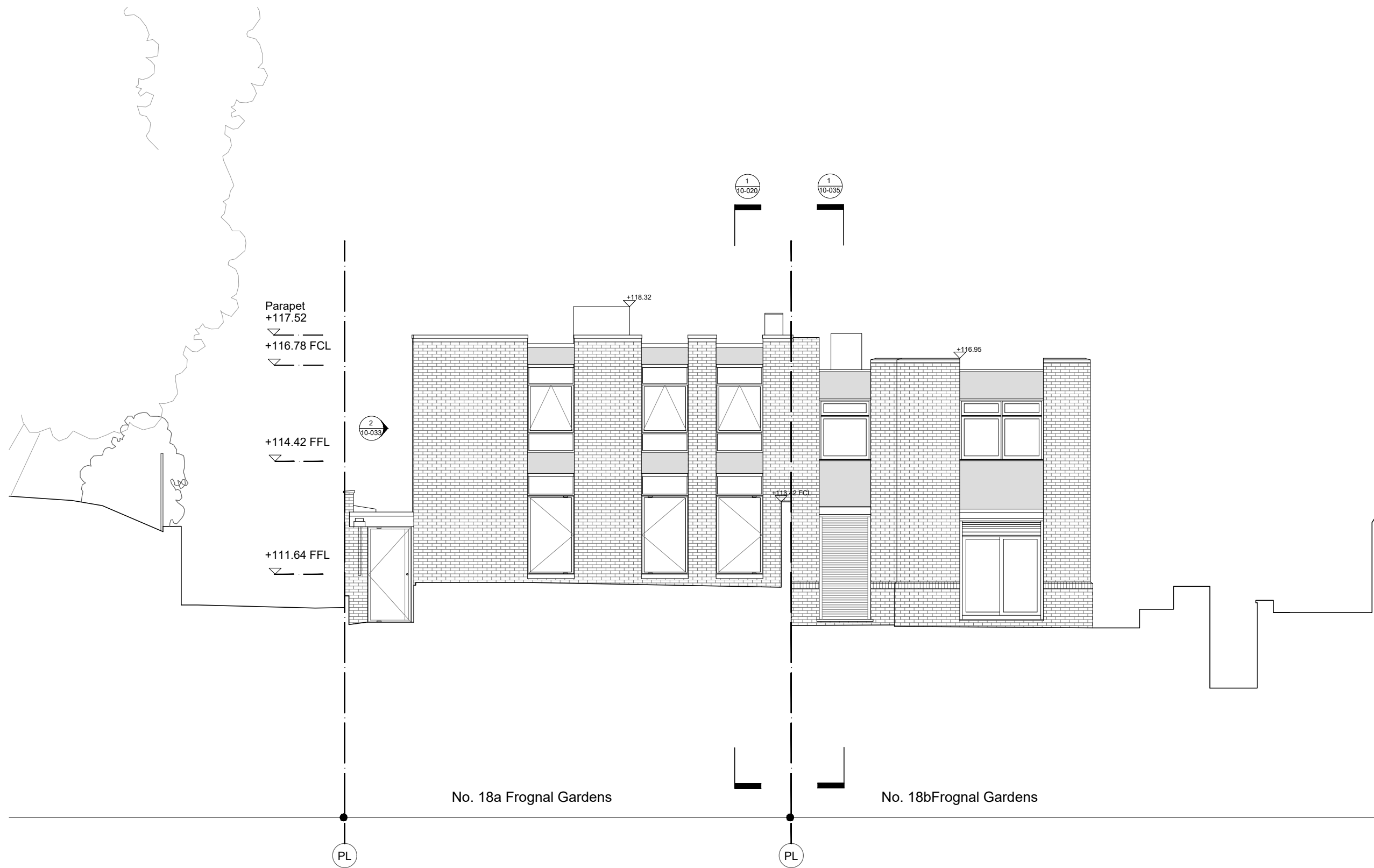
1 EXISTING NORTH ELEVATION