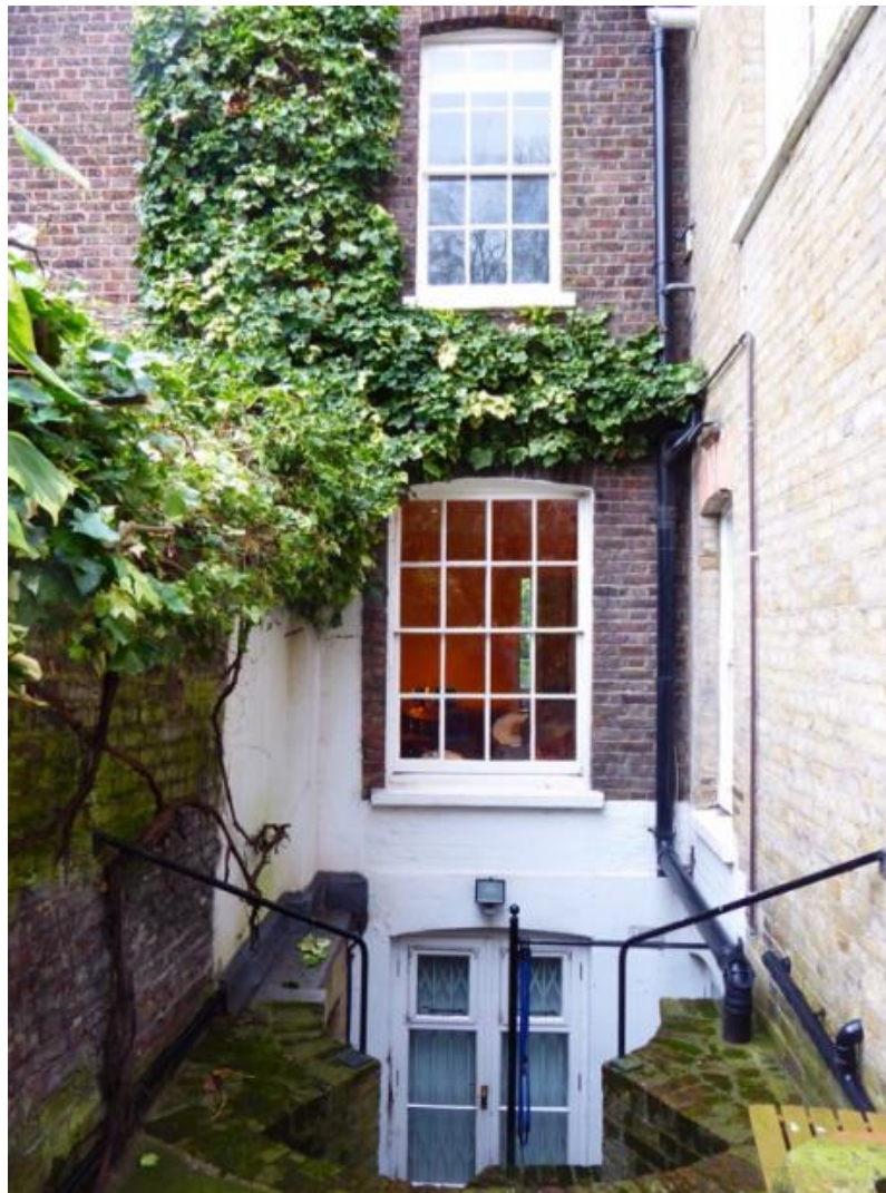
Figure 02: Rear elevation of adjoining no.7, with boundary wall to no.9 to the left of the photograph. Photograph taken from ground level, with basement/lightwell below.

residential accommodation at all levels including at ground floor and basement (see Figure 02 below).