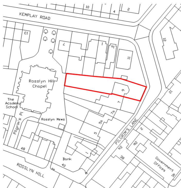
Figure 01: The existing site