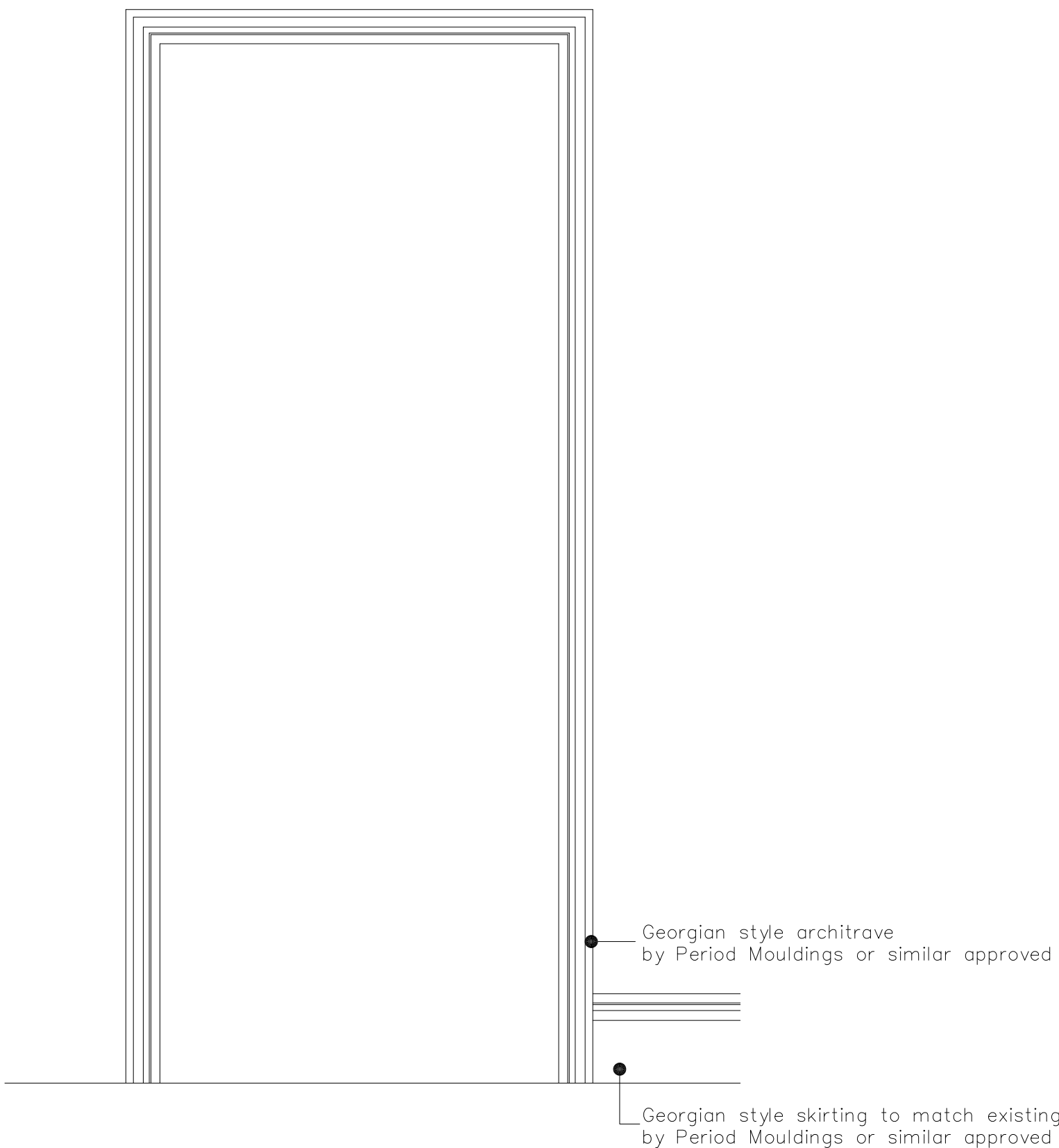
Architrave and skirting elevation 1:10

Do not scale: All written dimensions must be checked on site before work commences on site or in shop. Figured dimensions take precedence over those scaled. Discrepancies, where identified must be reported immediately. All work must be carried out in accordance with the Building Regulations and to the satisfaction of the Local Authority.