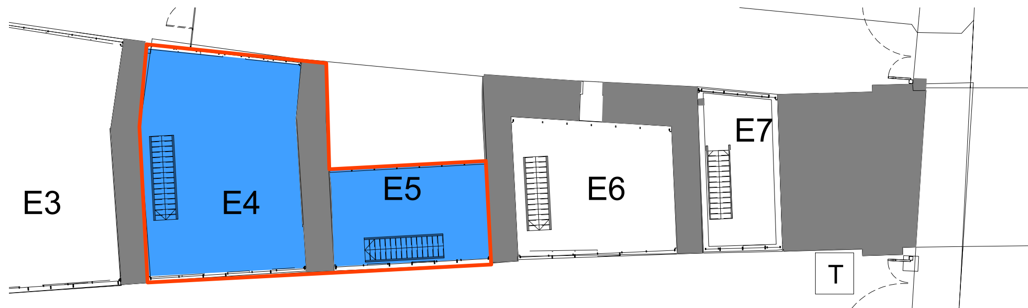
2 Proposed Mezzanine Plan 1 : 200