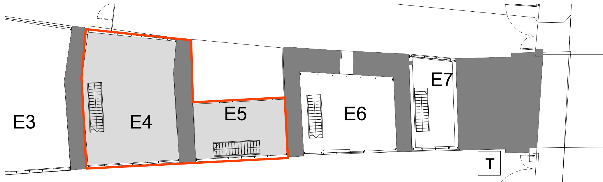
2 Existing Mezzanine Floor Plan 1 : 200